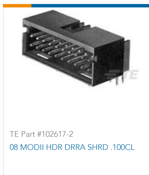
TE Part #102617-2 08 MODII HDR DRRA SHRD .100CL