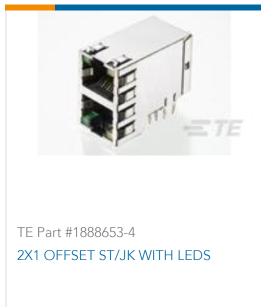
TE Part #1888653-4 2X1 OFFSET ST/JK WITH LEDS