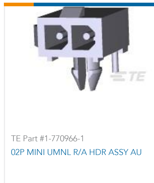
TE Part #1-770966-1 02P MINI UMNL R/A HDR ASSY AU