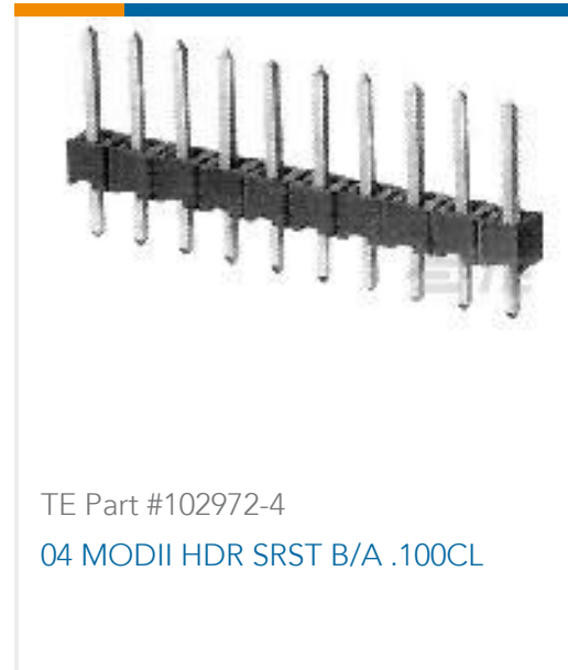
TE Part #102972-4 04 MODII HDR SRST B/A .100CL