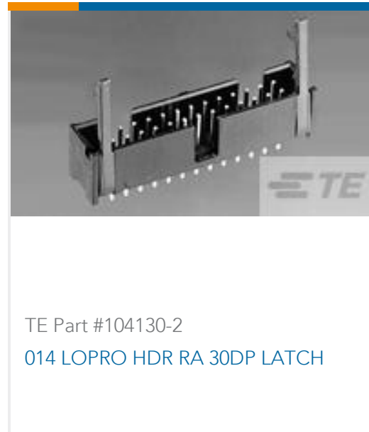
TE Part #104130-2 014 LOPRO HDR RA 30DP LATCH