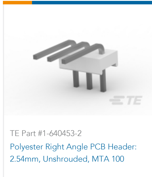
TE Part #1-640453-2 Polyester Right Angle PCB Header: 2.54mm, Unshrouded, MTA 100