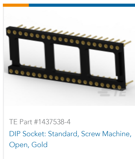
TE Part #1437538-4 DIP Socket: Standard, Screw Machine, Open, Gold