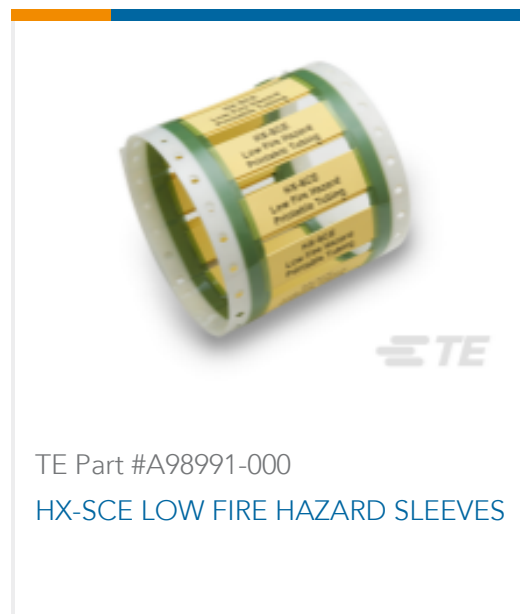
TE Part #A98991-000 HX-SCE LOW FIRE HAZARD SLEEVES