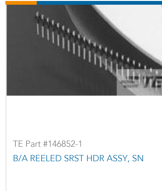
TE Part #146852-1 B/A REELED SRST HDR ASSY, SN