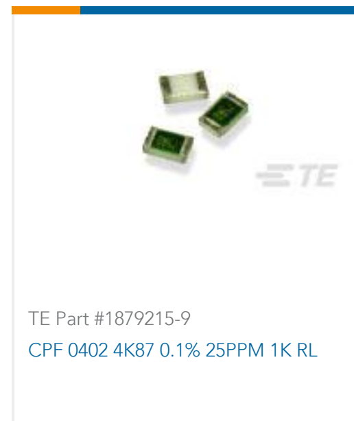
TE Part #1879215-9 CPF 0402 4K87 0.1% 25PPM 1K RL