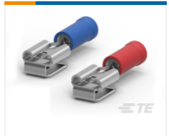
TE Part # CAT-P592-P624 PIDG PIGGY BACK FASTON TERMINAL

TE Part # CAT-P592-L853 PIDG LONG SPRING SPADE TONGUE TERMINALS