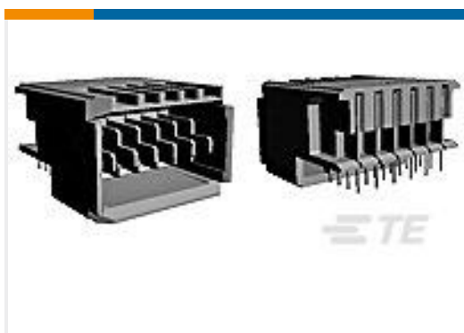
TE Part #120957-1 UPM EXPANDED PIN ASSEMBLY