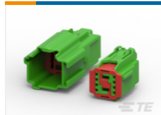
TE Part #1411169-1 GET .64 CONNECTOR SYSTEM, CONNECTOR HSG