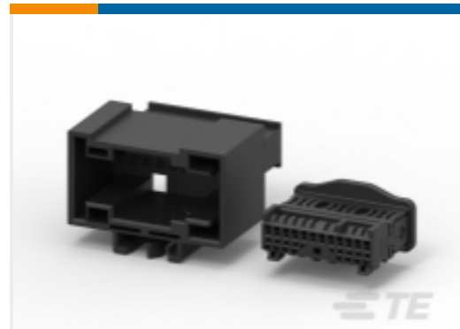
TE Part #1534102-1 MQS, CONNECTOR HOUSING