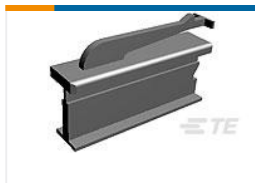
TE Part #1355528-2 MPQ 2.KONT-SICHNG8P