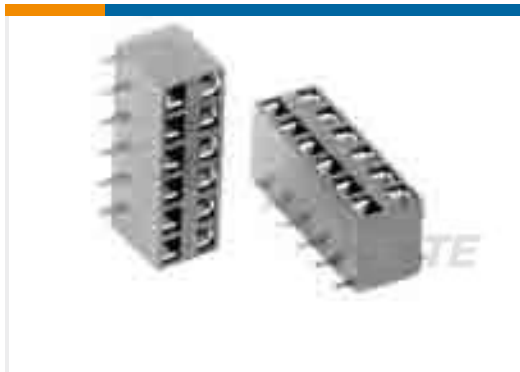
TE Part #1-966645-0 2x10P HV100 REC.CON, SMD, GOLD, TUBE PACK