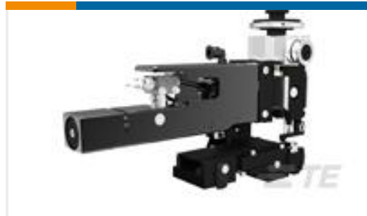
TE Part #2266355-2 OCEAN-2.0-APPLICATOR-S-130F180FA