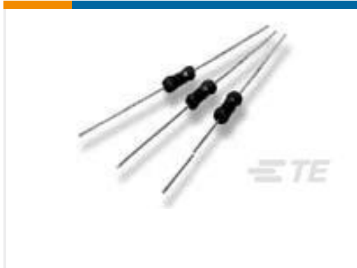
TE Part #2-1625886-1 1W SM M/OX 5% 4K7