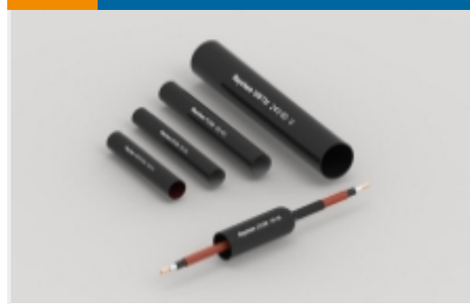
Power Cable Tubing & Accessories(8)