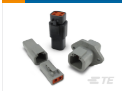
TE Part #DTP04-4P-E003 DEUTSCH DTP HOUSINGS