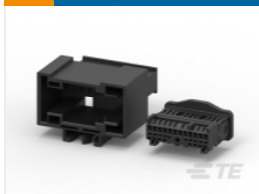
TE Part #2208339-1 MQS, CONNECTOR HOUSING