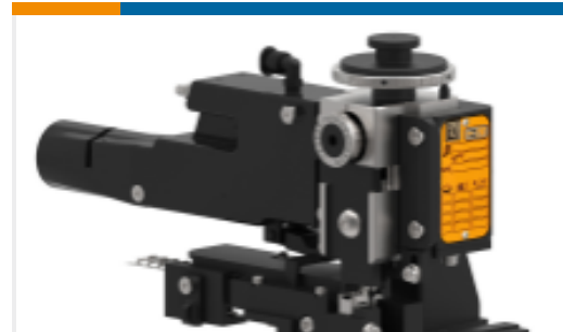
TE Part #2836176-2 OC-AT-S-FA-080F110OV-001-0095