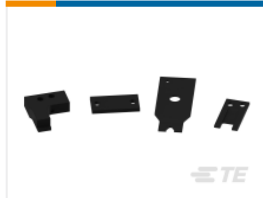
TE Part #1803350-1 FLOATING SHEAR, FRONT