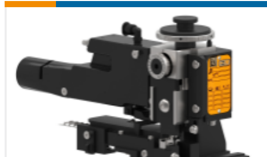
TE Part #2266583-2 OCEAN_2.0-APPLICATOR-S-165F244OV