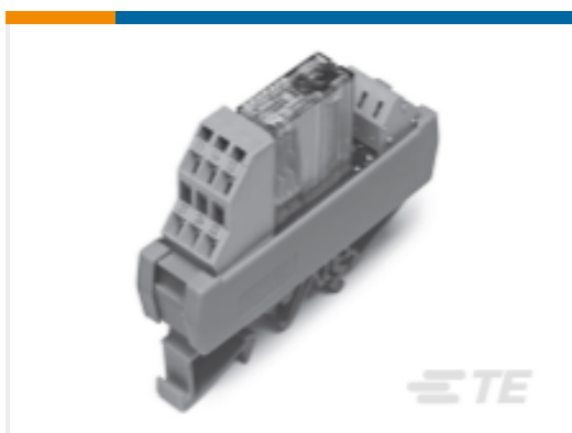
TE Part #1415060-1 Force Guided Power Relay, DIN-rail