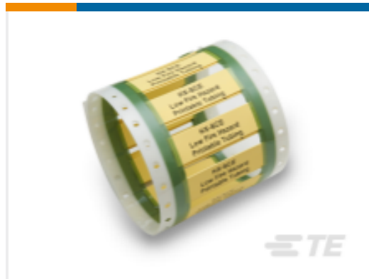
TE Part #F54891-000 HX-SCE LOW FIRE HAZARD SLEEVES