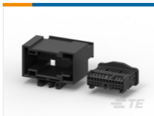
TE Part #2141576-3 MQS, CONNECTOR HOUSING