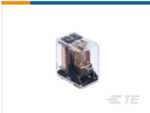
TE Part #1393809-1 Signal Relays: 5 amp, Monostable DC