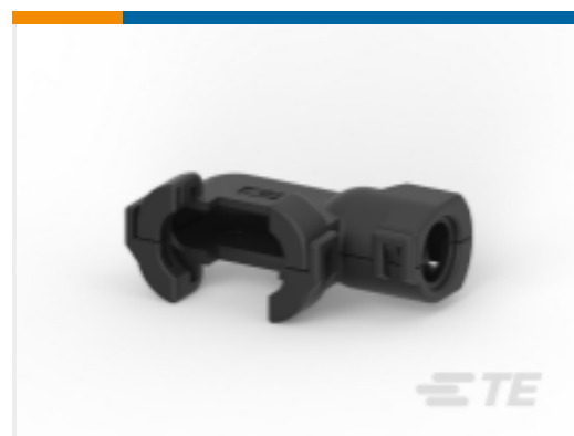
TE Part #2272165-1 MCON WIRE DRESS, 3P, RIGHT ANGLE