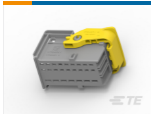
TE Part #1-2141847-3 AMP MCP BACKSHELLS