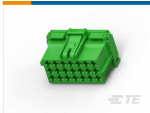
TE Part #1-2141847-2 AMP MCP, UNSEALED CONNECTOR HOUSING