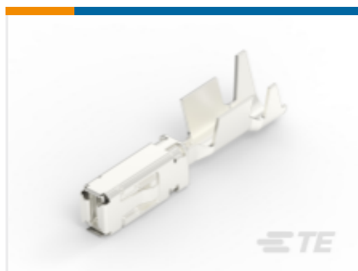
TE Part #1670326-3 AMP MCP, SFC, RECEPTACLE