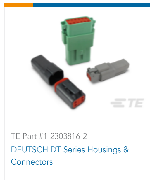
TE Part #1-2303816-2 DEUTSCH DT Series Housings & Connectors