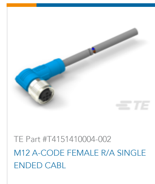
TE Part #T4151410004-002 M12 A-CODE FEMALE R/A SINGLE ENDED CABL