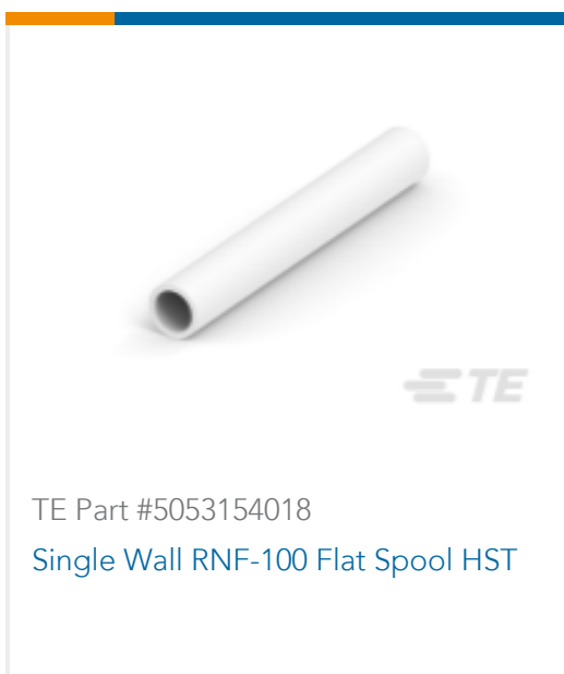
TE Part #5053154018 Single Wall RNF-100 Flat Spool HST