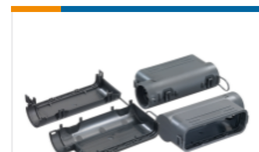
TE Part #1-2500035-1 SRC Male Conduit Cover