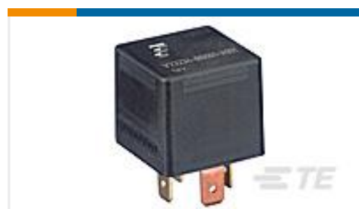
TE Part #1-1904008-2 V23234B0002X012-EV-100