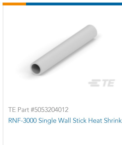
TE Part #5053204012 RNF-3000 Single Wall Stick Heat Shrink