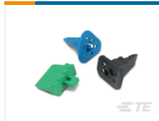
TE Part #W6P DEUTSCH DT WEDGELOCKS