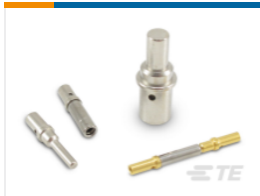
TE Part #0462-209-16141 DEUTSCH SOLID CONTACTS