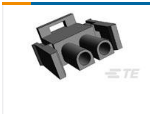
TE Part #1-480698-0 02P UMNL PLUG HSG NATL