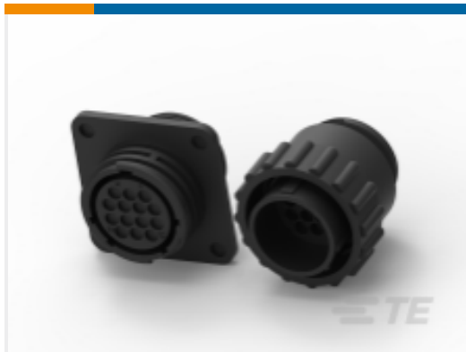
TE Part #206429-1 CPC SERIES 6