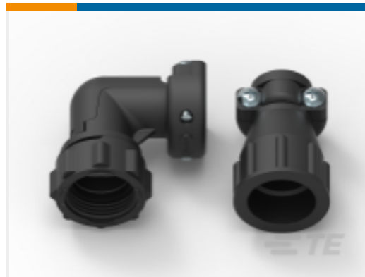
TE Part #206070-8 CPC CABLE CLAMPS