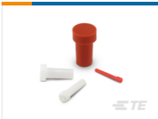
TE Part #114017-ZZ DEUTSCH SEALING PLUGS