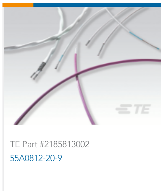
TE Part #2185813002 55A0812-20-9