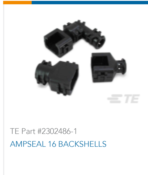
TE Part #2302486-1 AMPSEAL 16 BACKSHELLS