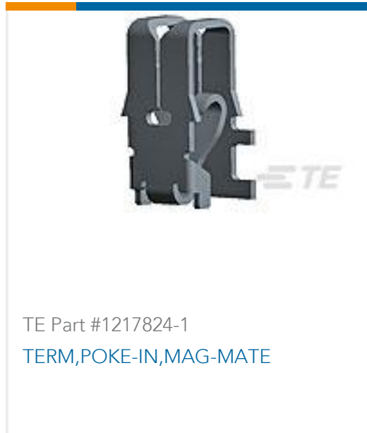
TE Part #1217824-1 TERM,POKE-IN,MAG-MATE