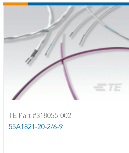
TE Part #318055-002 55A1821-20-2/6-9