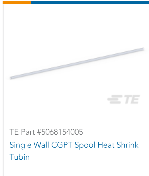
TE Part #5068154005 Single Wall CGPT Spool Heat Shrink Tubin