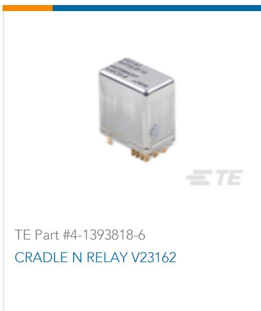
TE Part #4-1393818-6 CRADLE N RELAY V23162