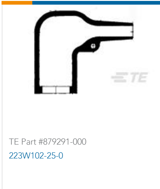
TE Part #879291-000 223W102-25-0