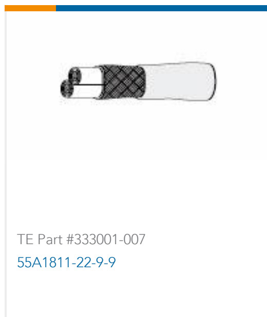
TE Part #333001-007 55A1811-22-9-9