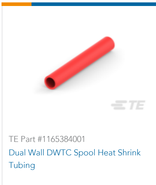
TE Part #1165384001 Dual Wall DWTC Spool Heat Shrink Tubing