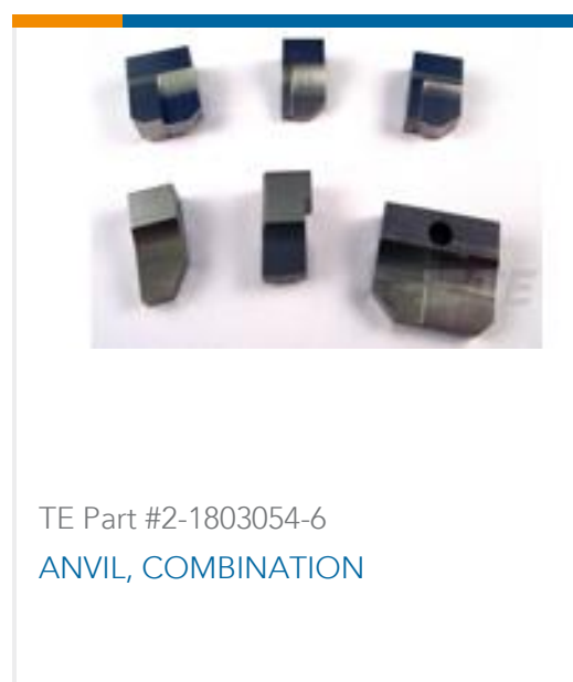
TE Part #2-1803054-6 ANVIL, COMBINATION