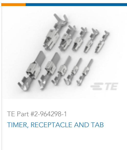
TE Part #2-964298-1 TIMER, RECEPTACLE AND TAB