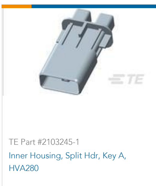
TE Part #2103245-1 Inner Housing, Split Hdr, Key A, HVA280