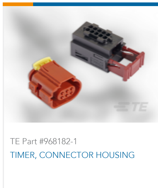
TE Part #968182-1 TIMER, CONNECTOR HOUSING