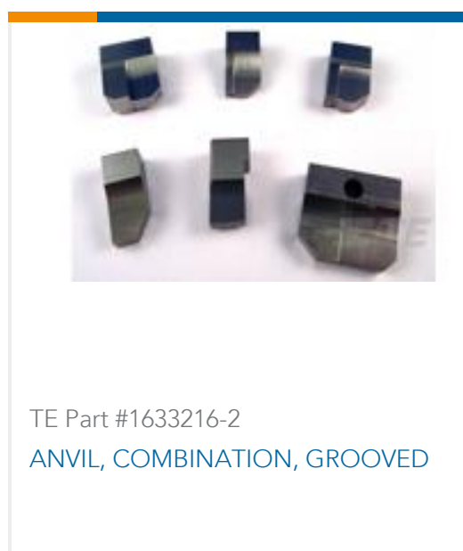
TE Part #1633216-2 ANVIL, COMBINATION, GROOVED