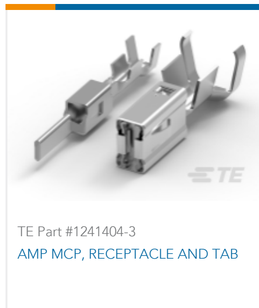
TE Part #1241404-3 AMP MCP, RECEPTACLE AND TAB