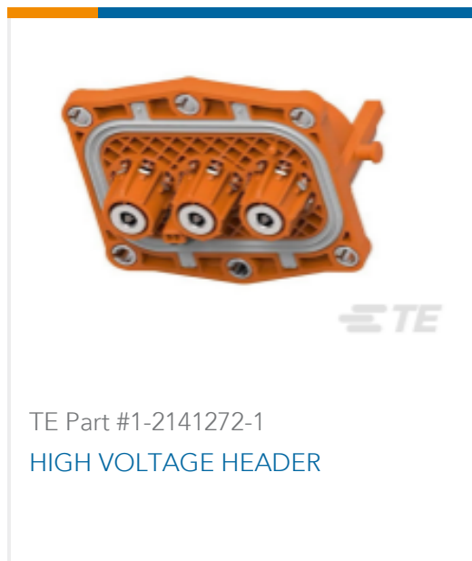
TE Part #1-2141272-1 HIGH VOLTAGE HEADER