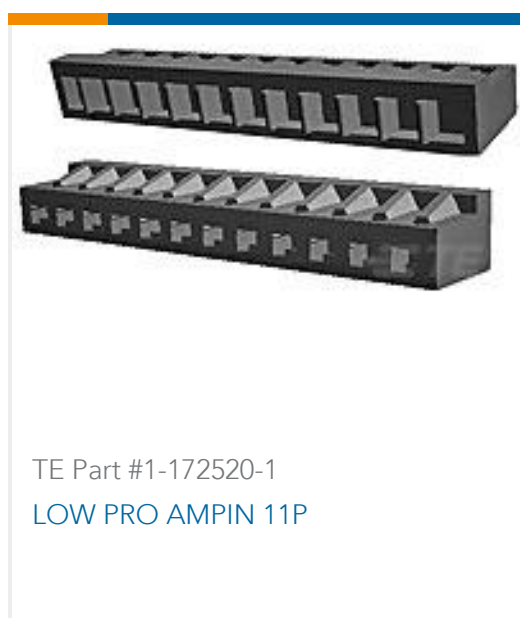
TE Part #1-172520-1 LOW PRO AMPIN 11P