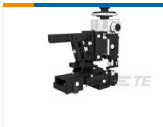
TE Part #2151274-1 OCEAN_2.0_APPLICATOR-S-100F1300