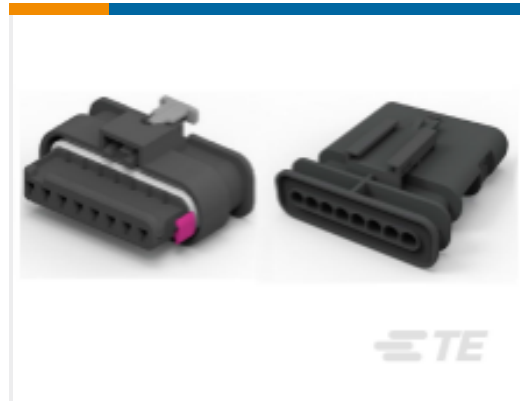
TE Part #1-2287970-5 MCON, CONNECTOR HOUSING