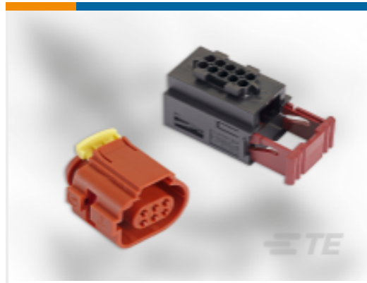
TE Part #1-965640-4 TIMER, CONNECTOR HOUSING