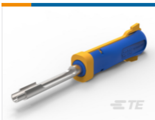
TE Part #2-1579007-3 EXTRACTION TOOL