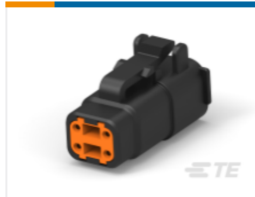
TE Part #DTMH06-4SA PLG, 4P, BLK, N, HI TEMP, A