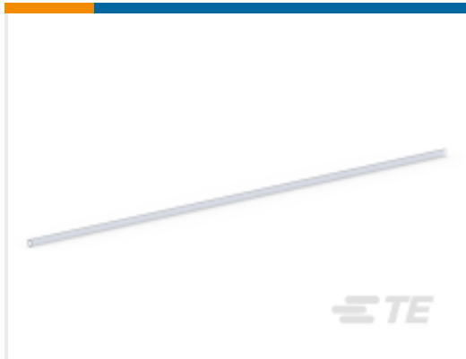
TE Part #2532994001 Single Wall CGPT Spool Heat Shrink Tubing