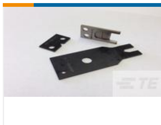
TE Part #240651-4 BLADE, SLUG