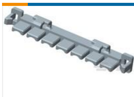
TE Part #1-1969609-2 12P VAL-U-LOK TPA 26-22 AWG