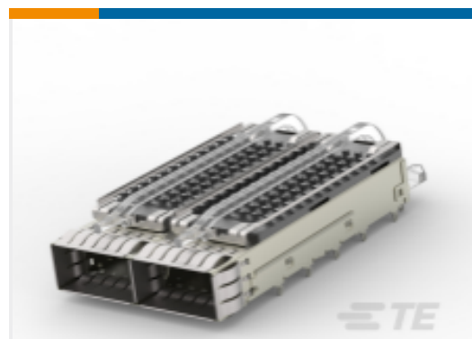
TE Part #2170808-1 QSF28, 1X2, CAGE ASSY, SPRING, HS, LP