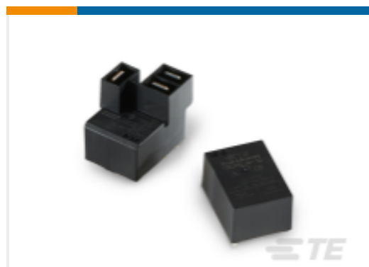
TE Part #1558662-4 PCB Power Relay: 30 amp, Monostable DC