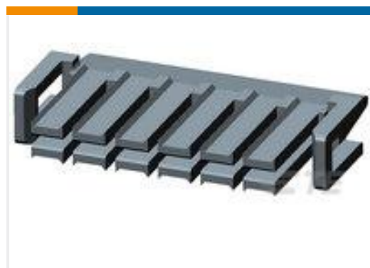
TE Part #2-1969541-8 RETAINER, TPA, DUAL ROW, EP2.5