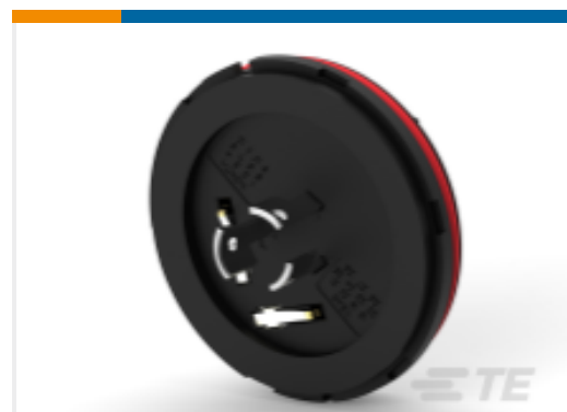
TE Part #1-2336396-1 ASSEMBLY, LIGHT CONTROLLER BASE, W/VENT