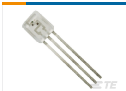
TE Part #11032254-00 PHOTO OPTIC EMITTER ASSEMBLY