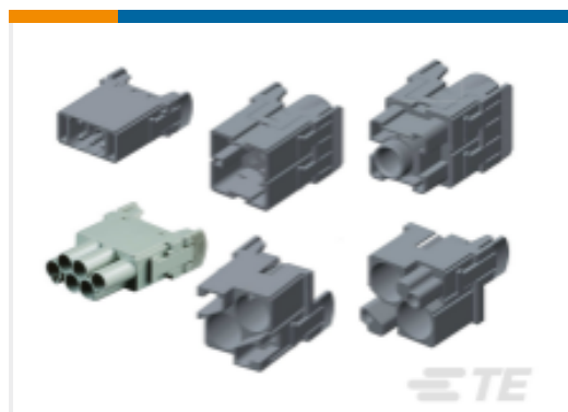
TE Part #T2111092201-007 HDC HMN - RAIL COMPLIANT MODULAR SYSTEM