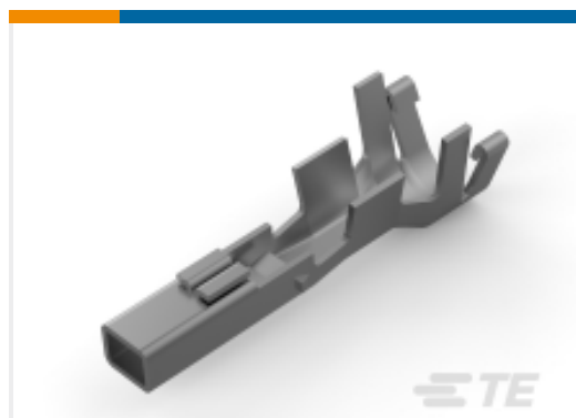
TE Part #177915-9 POWER DBL LOCK REC CONT