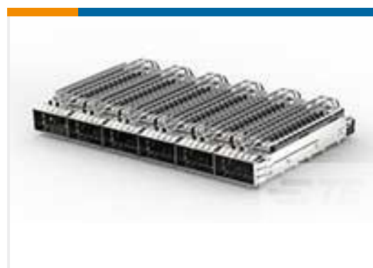
TE Part #2-2170708-1 CAGE ASSY, 1X6, QSF28, SPRING, HS, LP