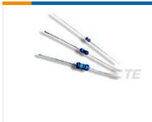
TE Part #1622537-2 LR1 1% 619R