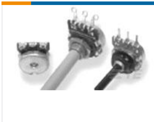
TE Part #1624143-1 23E 47KA 6X50PL B9 M10