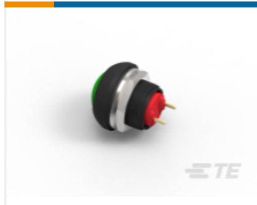
TE Part #1-2329360-9 PB OFF/ON RC GRE M4 TERM. IP68