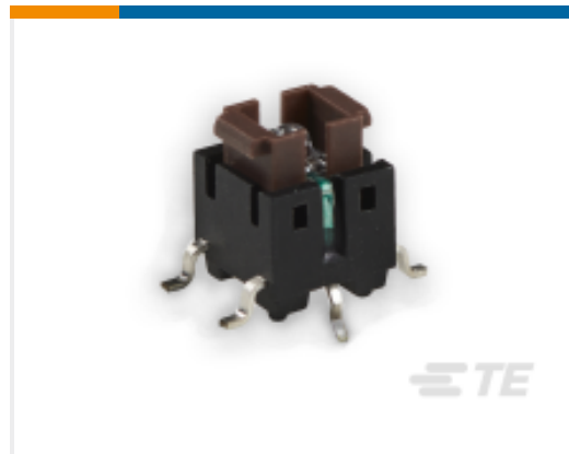
TE Part #1-2213819-0 6X6 ILL TACT SMT 100GF HI PURE GREEN