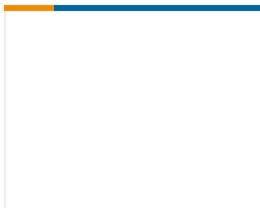
TE Part #878081N005 202K132-3/42-0