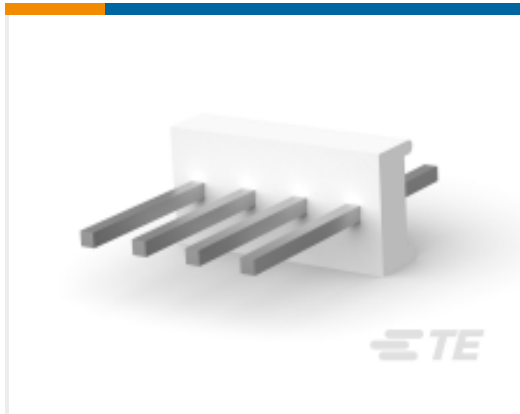
TE Part #1-640456-6 Polyester Vertical PCB Header: 2.54 mm, Unshrouded, No Mating Alignment