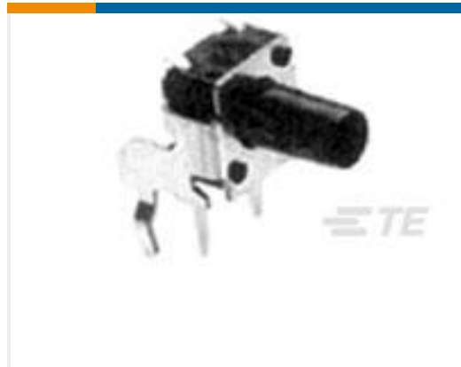
TE Part #1-1825027-1 FSMRA4JH04=R/A, TACT PB SW, 160G