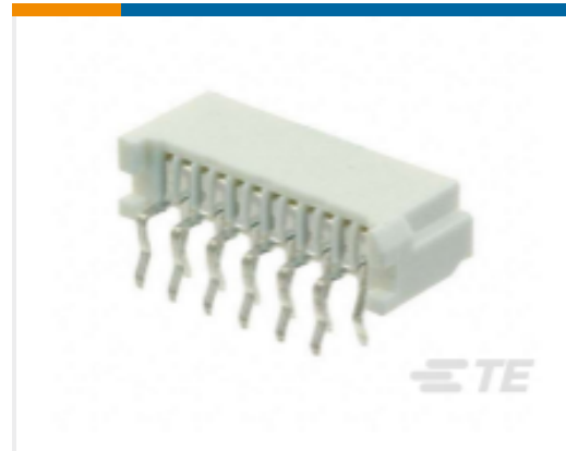
TE Part #1-84534-4 1.25mm FPC Connectors