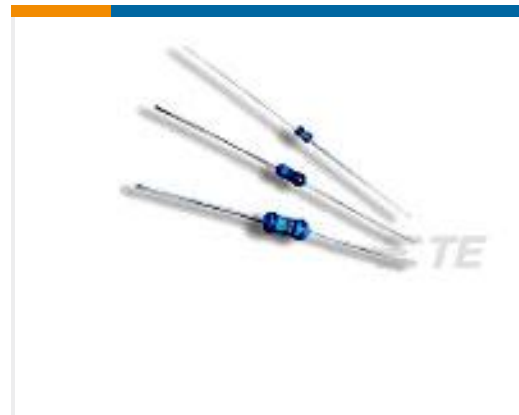
TE Part #1622308-5 LR1 1% 121K