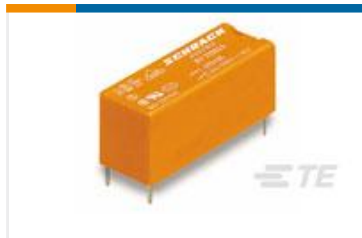
TE Part #4-1393224-5 RY211009