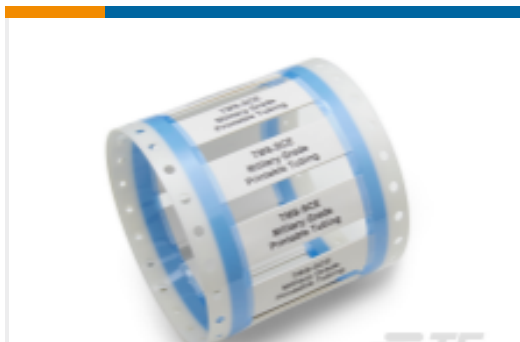
TE Part #4809650001 TMS-SCE MILITARY GRADE SLEEVES