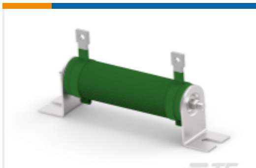
TE Part #1-1879445-5 Wirewound Resistor: Mineral, 2.5 Kw