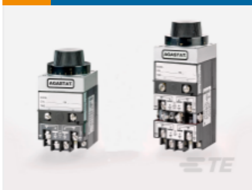
TE Part # 1423157-5 7012AC=RLY,STD,ON,2P,120VAC,15