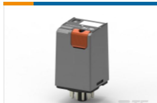
TE Part #8-1393096-4 MT321036