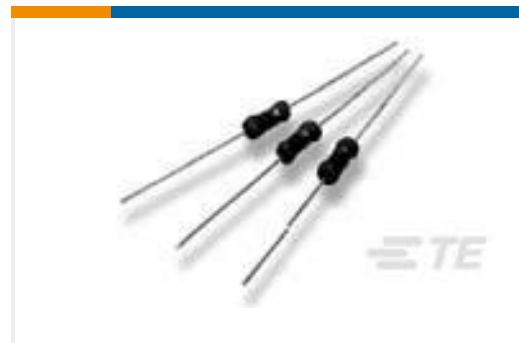
TE Part #1879353-9 RR02 5% 9K1 AMMO