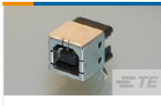
TE Part #292304-4 STD USB TYPE B, R/A, T/H, 15U" AU