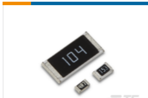
TE Part #2176346-7 CRGCO 1210 10R 5%