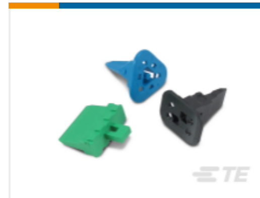
TE Part #W6P DEUTSCH DT WEDGELOCKS