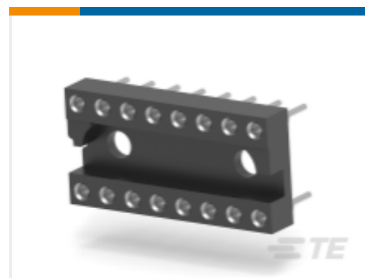
TE Part #1571550-9 DIP Socket: Standard, Screw Machine, Closed, Tin