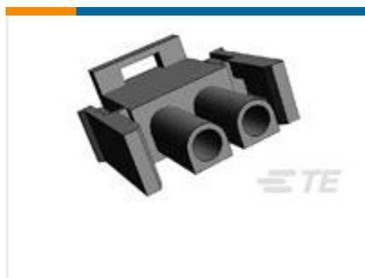
TE Part #1-480698-0 02P UMNL PLUG HSG NATL