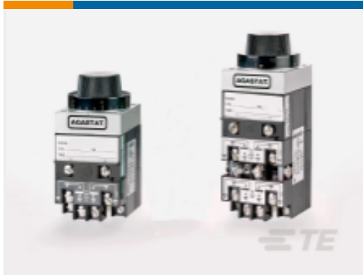
TE Part # 2-1423159-6 7012PD=RLY,STD,ON,2P,125VDC,50