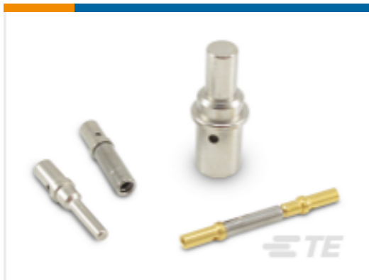
TE Part #0462-209-16141 DEUTSCH SOLID CONTACTS