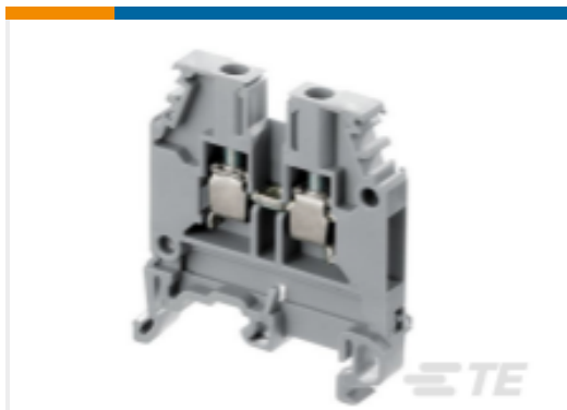
TE Part #1SNA115116R0700 M4/6