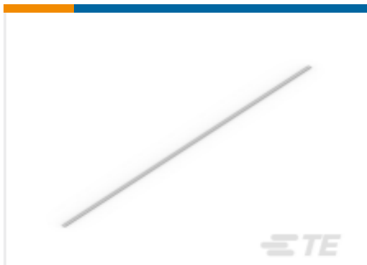
TE Part #1SNA163350R1500 PRH2R