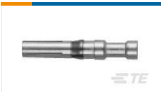
TE Part #1-1105301-1 HVT-C-Bu.Ag.0,5 qmm