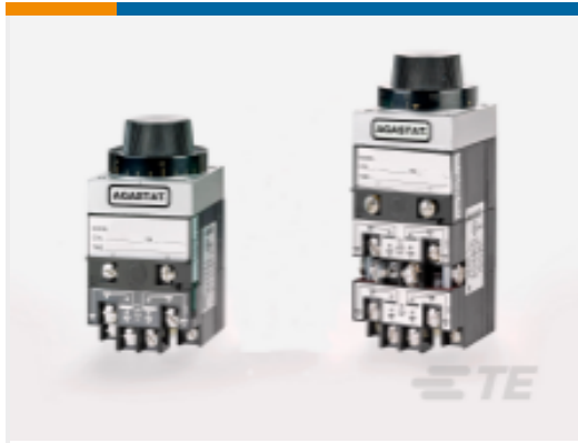
TE Part # 2-1423157-4 7012AK=RLY,STD,ON,2P,120VAC,30