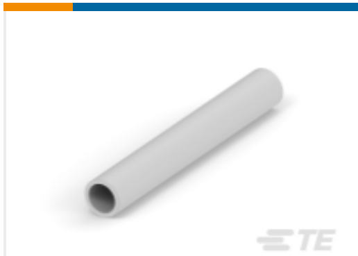
TE Part #1929492002 RNF-3000 Single Wall Stick Heat Shrink