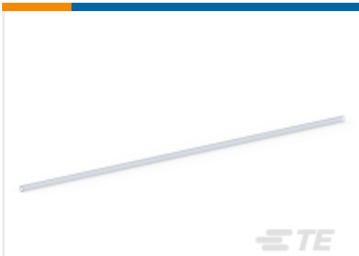
TE Part #1707634001 Single Wall CGPT Spool Heat Shrink Tubin