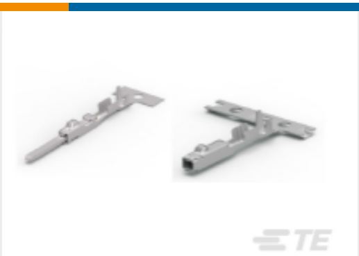
TE Part #1718758-2 MCON, RECEPTACLE AND TAB