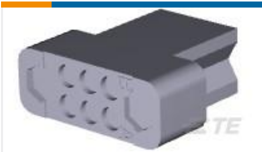
TE Part #202758-3 6 PL. BLOCK