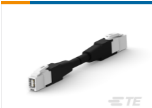
TE Part #2159683-2 C/A, RJ.5 TO RJ.5, L=1000