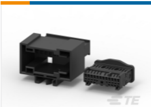
TE Part #1745005-1 MQS, CONNECTOR HOUSING