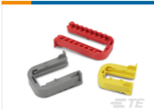
TE Part #1703810-1 HEAVY DUTY CONNECTORS FIXING SLIDES