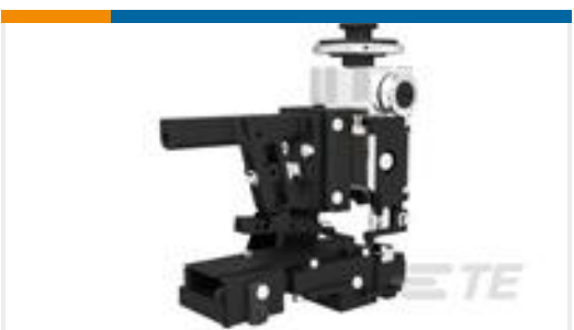
TE Part #2266162-1 OCEAN-2.0-APPLICATOR-S-042F055F