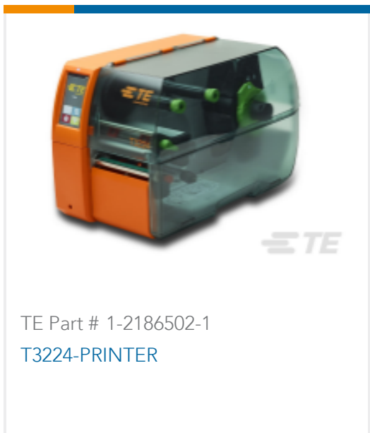
TE Part # 1-2186502-1 T3224-PRINTER