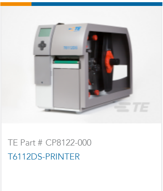
TE Part # CP8122-000 T6112DS-PRINTER