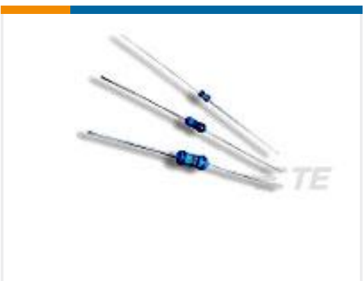
TE Part #1622541-1 LR1 1% 62R