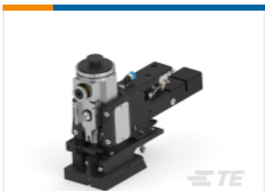
TE Part #2150738-1 OCEAN-2.0-APPLICATOR-E-080F100F