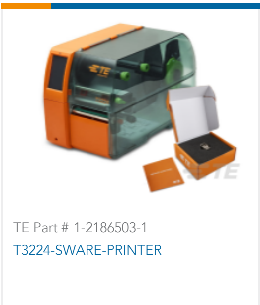
TE Part # 1-2186503-1 T3224-SWARE-PRINTER