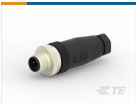
TE Part #T4111001041-000 RPC-M12-MS-4CON-PG7-MU