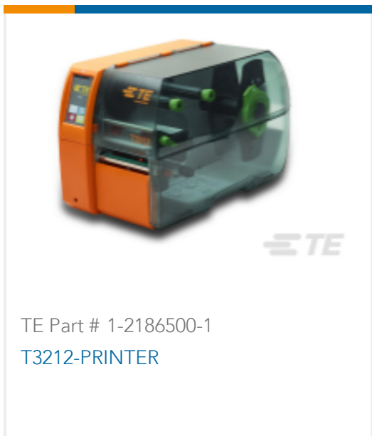
TE Part # 1-2186500-1 T3212-PRINTER