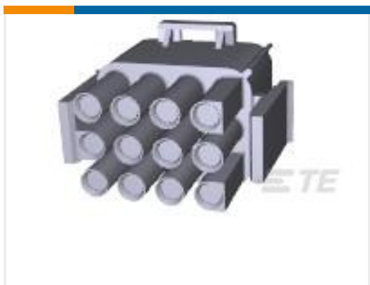
TE Part #350735-1 12P UMNL PLUG HSG