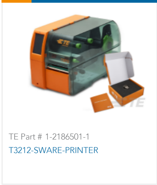
TE Part # 1-2186501-1 T3212-SWARE-PRINTER