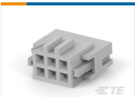
TE Part #215882-6 AMP-LATCH MIL TYPE RCPT CONNECTOR