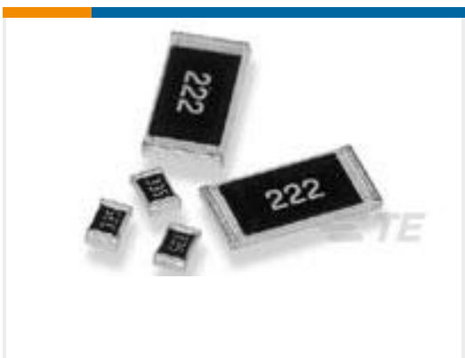
TE Part #2-1879495-2 CRGH0603 5% 100K 0.2W