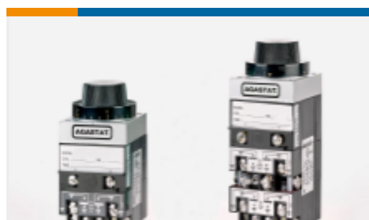
TE Part #1755170-1 7022OCIM=RLY,STD,OFF,2P,24V,15S,I, M