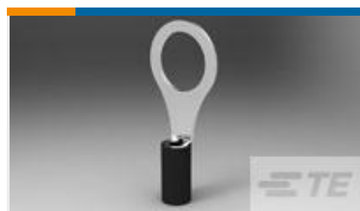
TE Part #342066 16-14 H.D.R/T 1/2" STUD BLACK