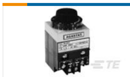
TE Part #6-1755142-4 7022WDIM=RLY,STD,OFF,2P,96V,50S,I, M