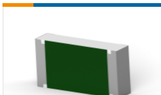
TE Part #9-2176397-8 3502 11K 1%