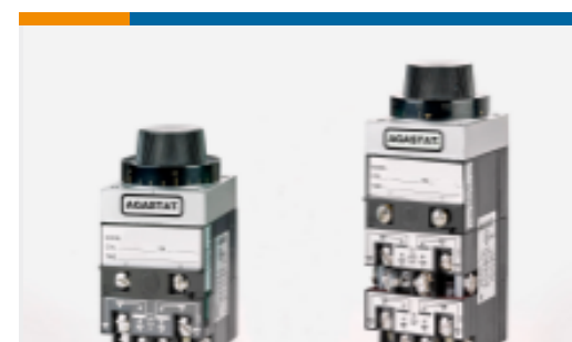
TE Part #7-1472995-0 7012WDS=RLY,STD,ON,2P,96V,50S,S