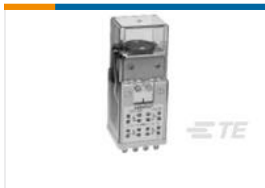
TE Part #1423155-4 GPCN=RELAY, 48VDC W/BLOWOUT DE