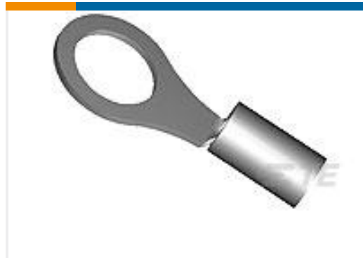
TE Part #324911-1 TERMINAL,SOLIS R 12-10 6 TAPE