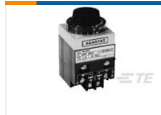
TE Part #3-1423162-0 7022BKX=RLY,STD,OFF,2P,240VAC