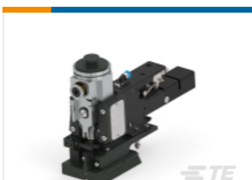
TE Part #2150653-1 OCEAN_2.0_APPLICATOR-E-140F2200