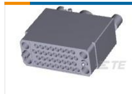
TE Part #213300-2 34 PASSM KIT,M SER (CC,JS)