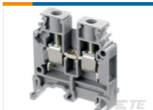
TE Part #1SNA105004R2200 M6/8