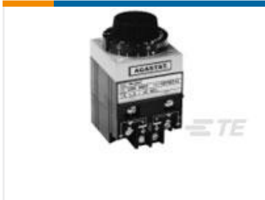
TE Part #6-1755142-4 7022WDIM=RLY,STD,OFF,2P,96V,50S,I, M