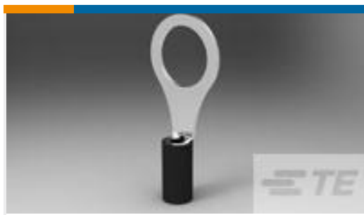
TE Part #342066 16-14 H.D.R/T 1/2" STUD BLACK