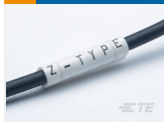
TE Part #EC0437-000 06153411