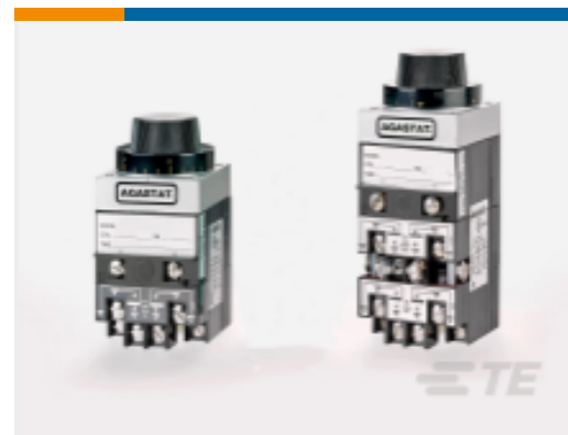
TE Part #1755170-1 7022OCIM=RLY,STD,OFF,2P,24V,15S,I, M