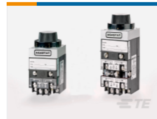
TE Part #7-1472995-0 7012WDS=RLY,STD,ON,2P,96V,50S,S