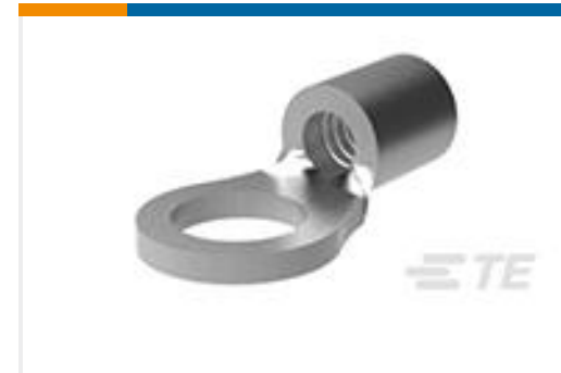
TE Part #165026 SOLIS 12-10 R M6