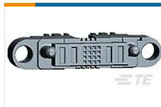
TE Part #1600606-2 PANEL MT RECPT HSG W/GUIDES P