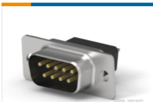
TE Part #2-748003-0 D-Sub Plug Assembly: Standard, Vertical, Shell Size 1, 2.74mm