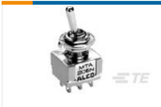
TE Part #1-1437558-1 MTA106DPC=(MSTA) SW TOG P/C TE