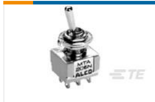
TE Part #2-1437558-2 MTA206P=(MSTA) SW TOG DPDT