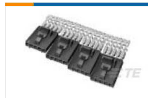
TE Part #1-103644-9 20 MTE RCPT SR LATCH .100CL