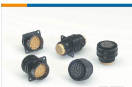
TE Part #ZPF000000000101093 FDDBA 50-12-10 SN-K 090 A1386