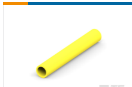
TE Part #1927574004 Dual Wall Heat Shrink Tubing: Spool