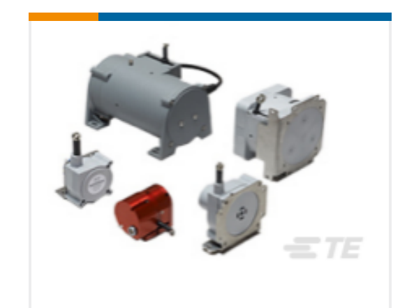
TE Part #SP2-4 CABLE ACTUATED POSITION STOCK LIST