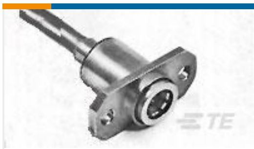
TE Part #1059456-1 4506 7985 02