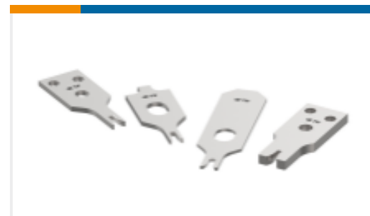
CRIMPER REPRESENTATION ONLY