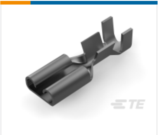
TE Part # 182485-4 FF 187 REC 0.5-1.5MM2 TPPB LP