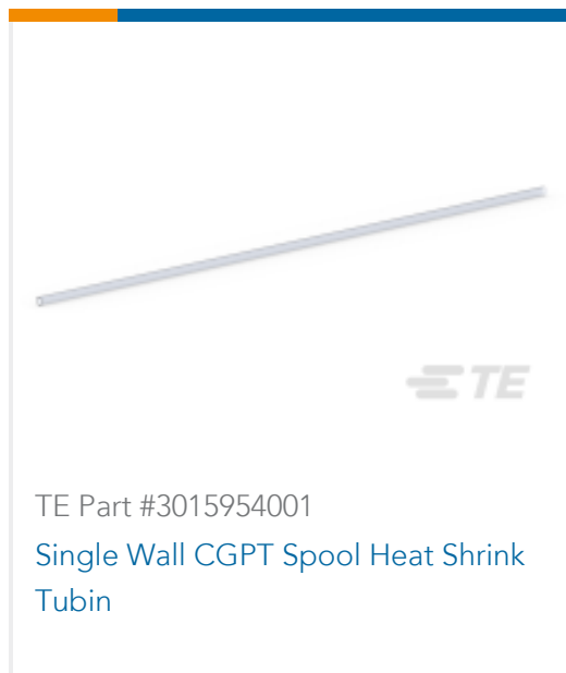
TE Part #3015954001 Single Wall CGPT Spool Heat Shrink Tubing