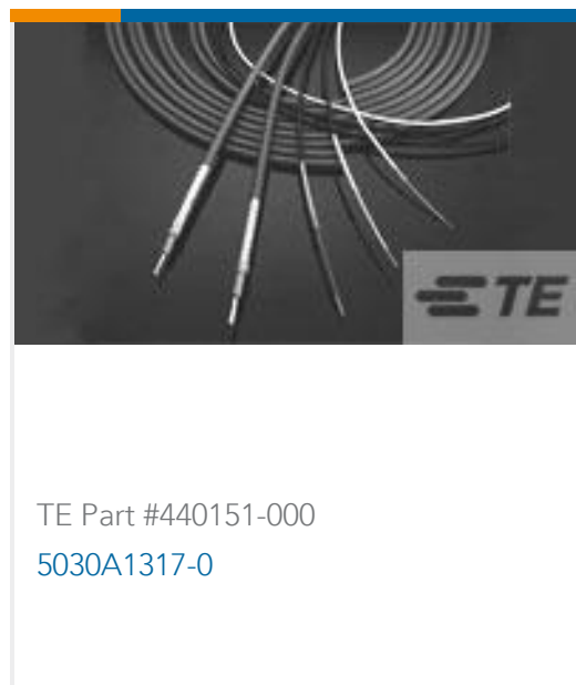
TE Part #440151-000 5030A1317-0