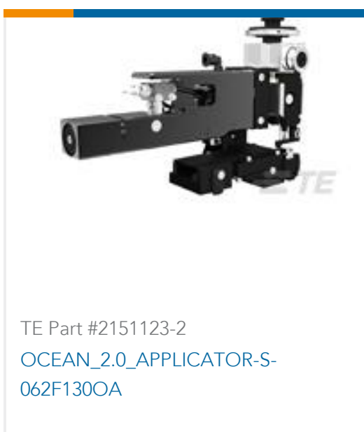
TE Part #2151123-2 OCEAN_2.0_APPLICATOR-S-062F1300A