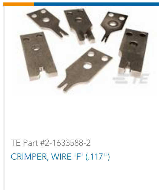
TE Part #2-1633588-2 CRIMPER, WIRE 'F' (.117")