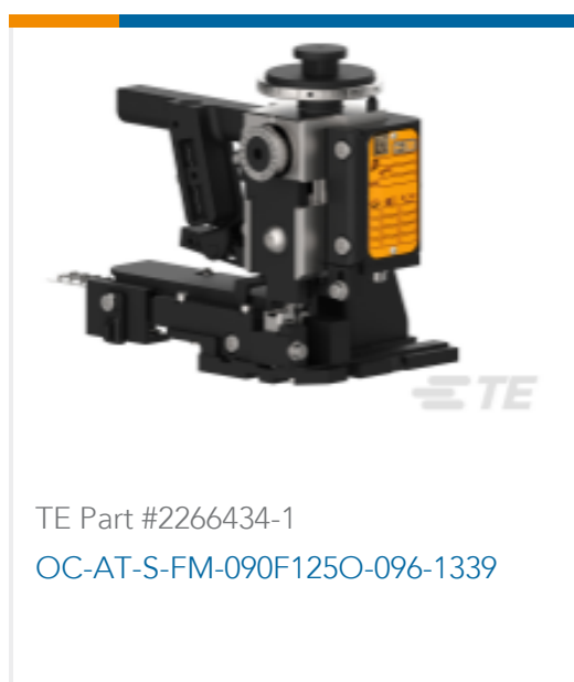
TE Part #2266434-1 OC-AT-S-FM-090F1250-096-1339