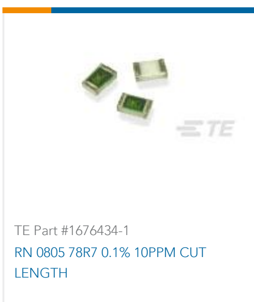
TE Part #1676434-1 RN 0805 78R7 0.1% 10PPM CUT LENGTH