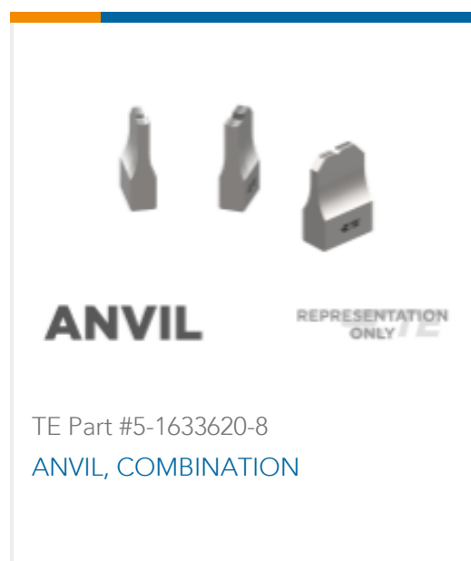
ANVIL REPRESENTATION ONLY TE Part #5-1633620-8 ANVIL, COMBINATION