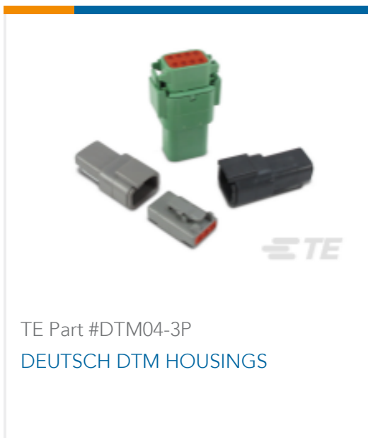
TE Part #DTM04-3P DEUTSCH DTM HOUSINGS