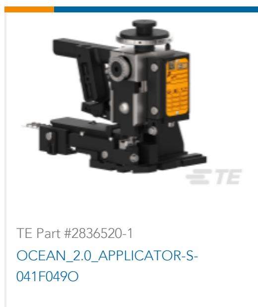
TE Part #2836520-1 OCEAN_2.0_APPLICATOR-S-041F0490