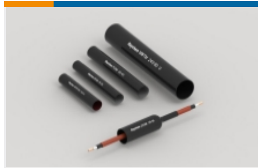
Power Cable Tubing & Accessories(93)