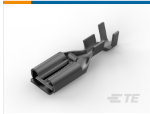
TE Part # 175022-1 250 PL EX REC. 18-14AWG PTBR