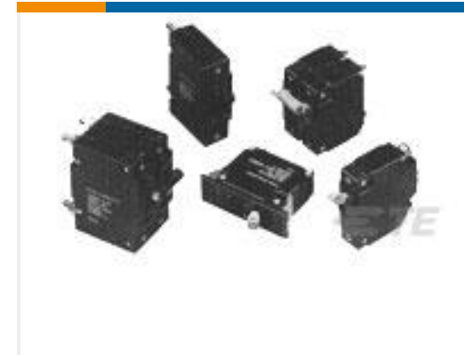
TE Part # 7-1393252-2 W67-X2Q13-30=M6/M7/M9/W6/W7