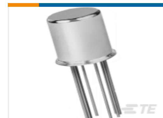
TE Part #1617169-2 JMSWDD-18XP = M39016/21-011P