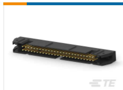
TE Part #102159-9 AMP-LATCH UNIVERSAL HEADERS