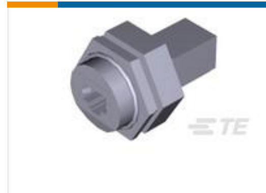
TE Part #1546413-3 ETHERNET RJ-45 BLKHD PASSTHRU