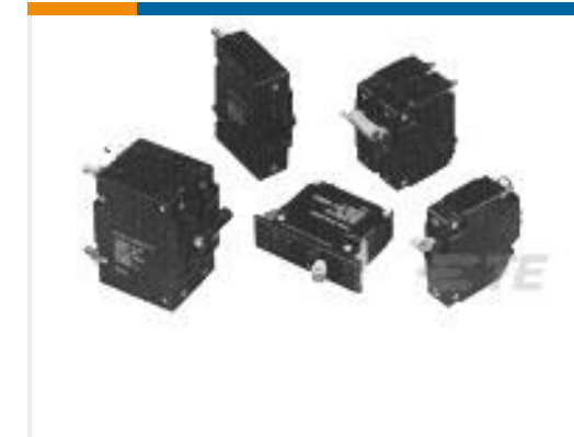
TE Part # 8-1393252-6 W67-X2Q52-30=M6/M7/M9/W6/W7