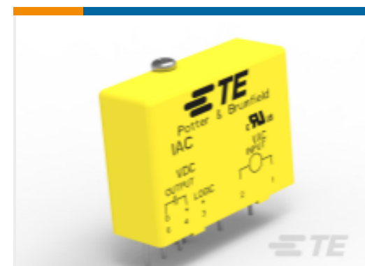
TE Part #1-1393028-1 P&B SSR SLIM INPUT AC MODULES