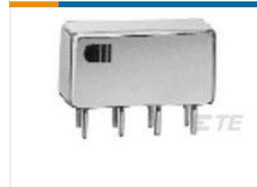
TE Part #1617037-9 HFW5A1201K00 = HFW 5AMP RELAY