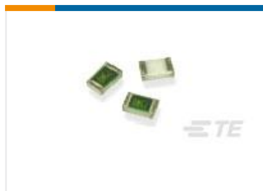
TE Part #1-2176087-1 RP 1J 0.166W 86R6 0.1% 25PPM 1K RL