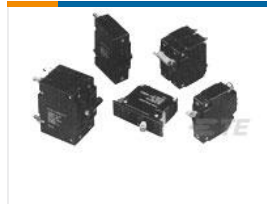
TE Part # 6-1393252-1 W67-X2Q12-30=M6/M7/M9/W6/W7