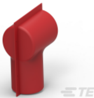
TE Part #R65489-000 BCIC-13-13-PT(B6)