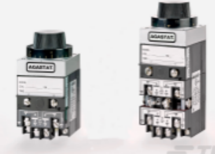
TE Part #6-1423157-2 7012ADT=RLY,STD,ON,2P,120AC,5