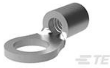
TE Part #8-322454-2 TERMINAL,SOLIS R 12-10 8