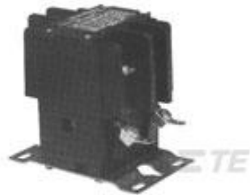
TE Part #6-1393132-1 P40C42D12C1-120=CONTACTORS