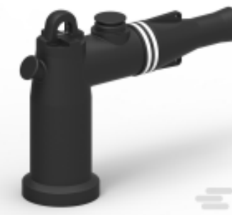
TE Part #BM1374-000 Load Break Elbow: 200A, 15 and 25 kV