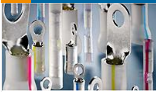
TE Part #53963-1 TERMINAL,PIDG PVF2 R 16-14HD 4