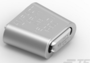
TE Part #83861-1 AMPACT TAP 1431 AAC-1272 ACSR