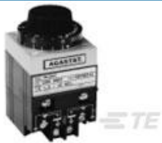
TE Part #1423157-3 7012ABL=RLY,STD,ON,2P,120VAC,