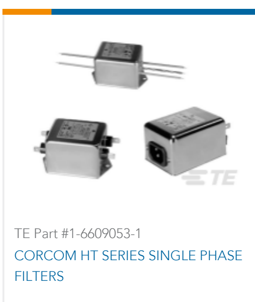
TE Part #1-6609053-1 CORCOM HT SERIES SINGLE PHASE FILTERS