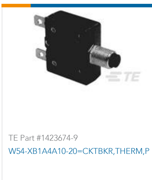
TE Part #1423674-9 W54-XB1A4A10-20=CKTBKR,THERM,P