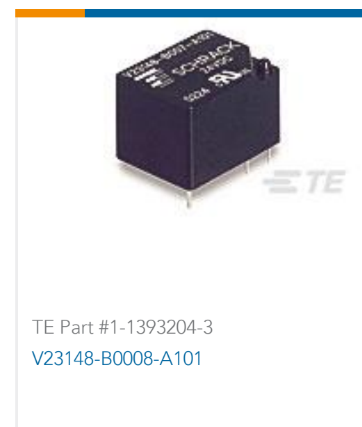
TE Part #1-1393204-3 V23148-B0008-A101