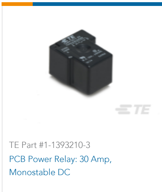
TE Part #1-1393210-3 PCB Power Relay: 30 Amp, Monostable DC