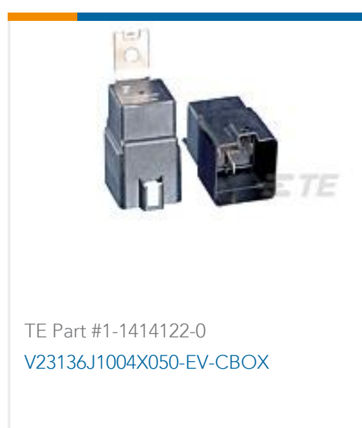
TE Part #1-1414122-0 V23136J1004X050-EV-CBOX