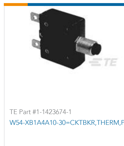
TE Part #1-1423674-1 W54-XB1A4A10-30=CKTBKR,THERM,P