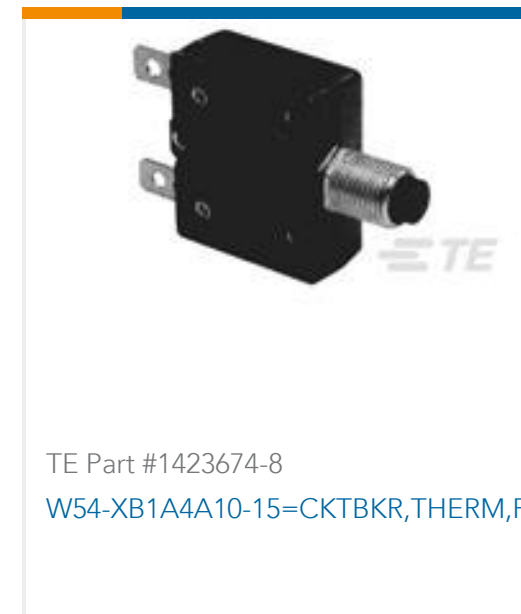
TE Part #1423674-8 W54-XB1A4A10-15=CKTBKR,THERM,P