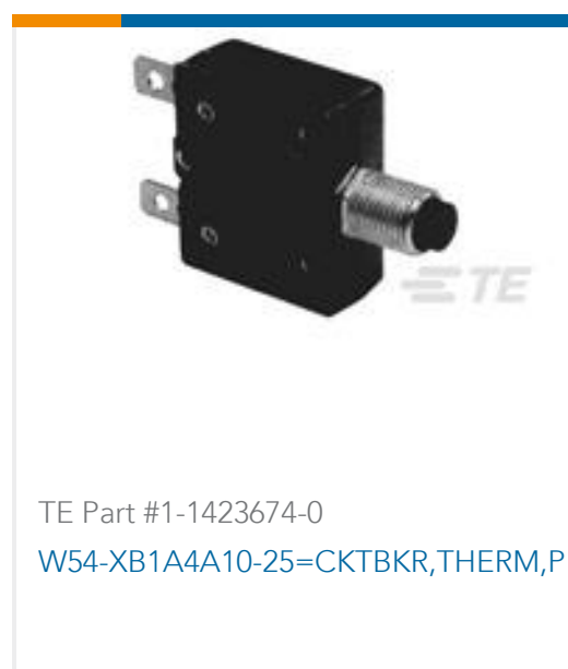
TE Part #1-1423674-0 W54-XB1A4A10-25=CKTBKR,THERM,P