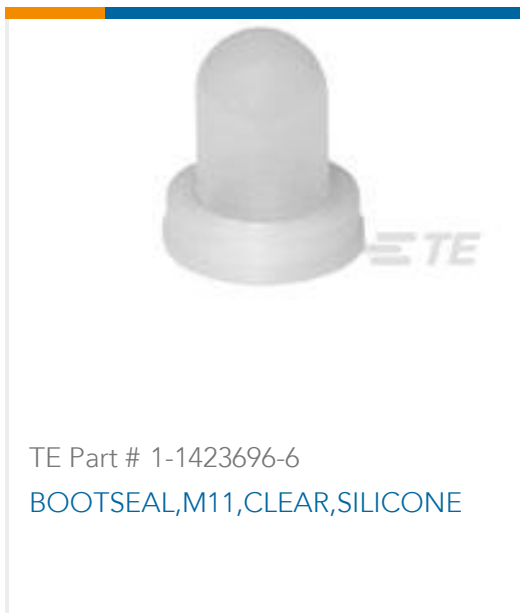
TE Part # 1-1423696-6 BOOTSEAL,M11,CLEAR,SILICONE