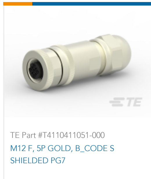
TE Part #T4110411051-000 M12 F, 5P GOLD, B_CODE S SHIELDED PG7