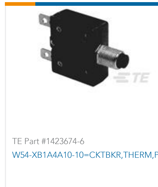
TE Part #1423674-6 W54-XB1A4A10-10=CKTBKR,THERM,P