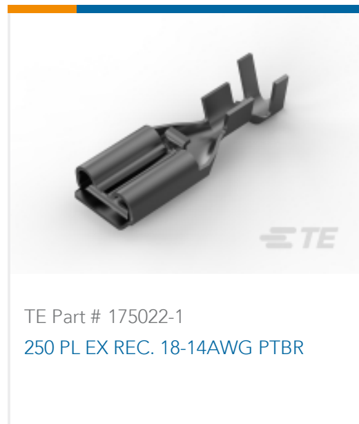
TE Part # 175022-1 250 PL EX REC. 18-14AWG PTBR