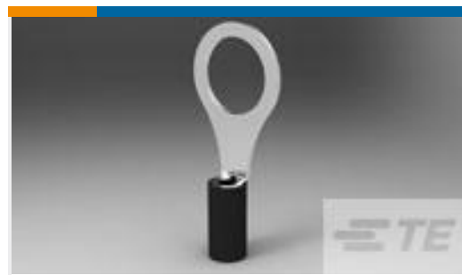
TE Part #342066 16-14 H.D.R/T 1/2" STUD BLACK