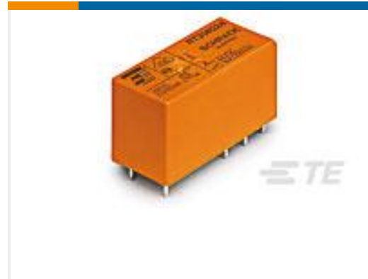
TE Part #2-1393239-3 RT134005