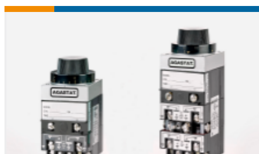
TE Part #1755170-1 7022OCIM=RLY,STD,OFF,2P,24V,15S,I, M