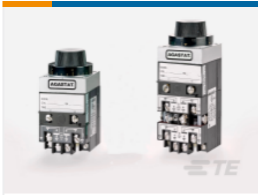
TE Part #9-1755142-8 7022OBIM=RLY,OFF,2P,24V,5S,I,M