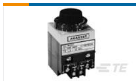
TE Part #6-1755142-4 7022WDIM=RLY,STD,OFF,2P,96V,50S,I, M