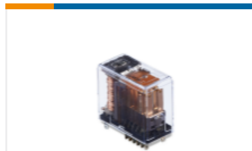
TE Part #2-1393813-8 CRADLE S RELAY V23054