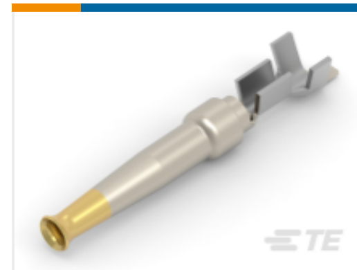
TE Part #1658537-3 D-Sub Conn Contacts: Socket, Phosphor Bronze, Signal, Size 20