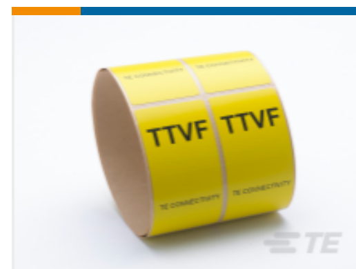
TE Part #097370-000 TTVF COLOR CODING FLAGGING PVF LABELS