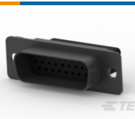
TE Part #1658671-1 D-Sub Crimp: Plug, Signal, 26 Posn, Pin Size 22, Shell Size 2