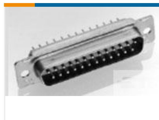
TE Part #205557-2 RECEIPT ASSY,15 POSN,AMPLIMITE