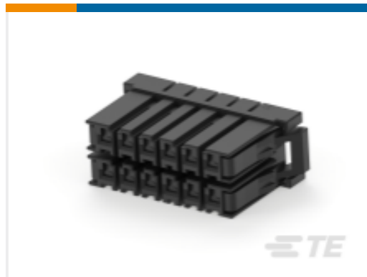
TE Part #1-178128-4 DYNAMIC 3200 REC AND TAB HSG