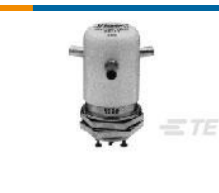
TE Part #1618278-1 KC-11=RELAY, VACUUM, SPDT