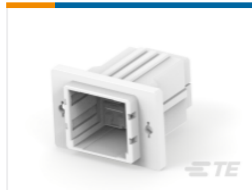
TE Part #1-179958-4 DYNAMIC 5000 REC AND TAB HSG