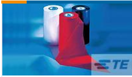
TE Part #310109-000 TMS-101-RIBBON-4RPSCE