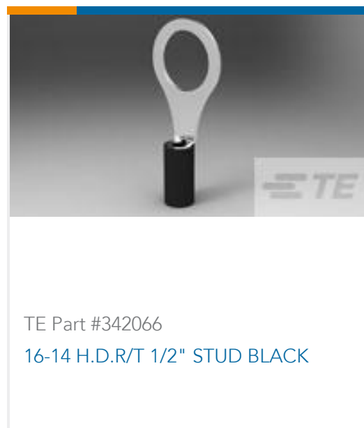
TE Part #342066 16-14 H.D.R/T 1/2" STUD BLACK