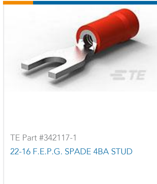
TE Part #342117-1 22-16 F.E.P.G. SPADE 4BA STUD