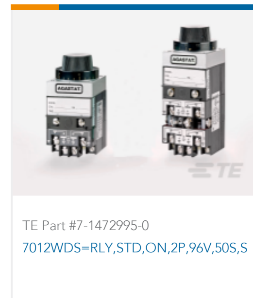
TE Part #7-1472995-0 7012WDS=RLY,STD,ON,2P,96V,50S,S