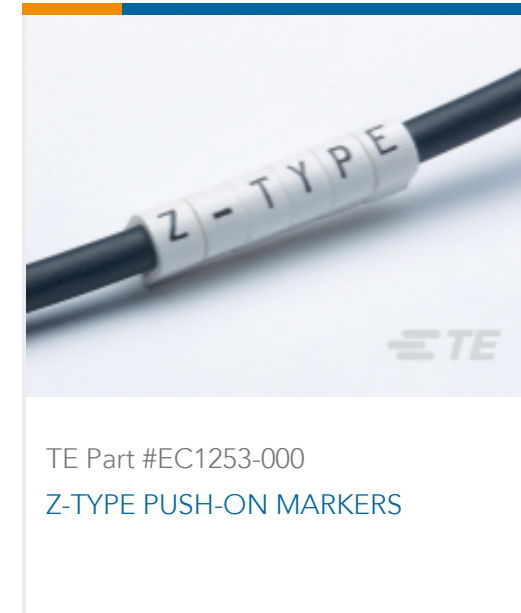
TE Part #EC1253-000 Z-TYPE PUSH-ON MARKERS