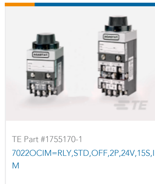
TE Part #1755170-1 7022OCIM=RLY,STD,OFF,2P,24V,15S,I, M