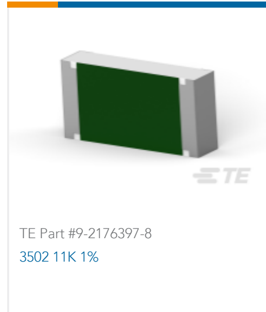
TE Part #9-2176397-8 3502 11K 1%