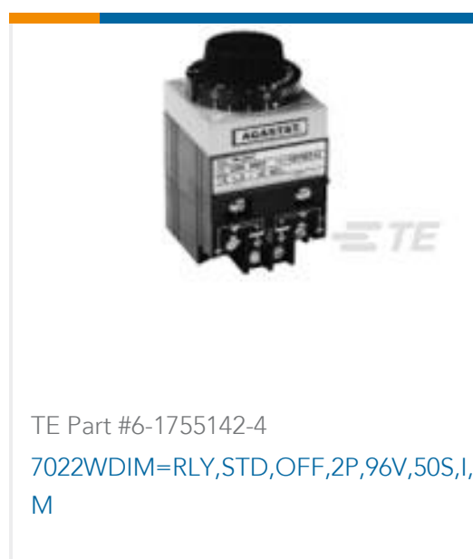
TE Part #6-1755142-4 7022WDIM=RLY,STD,OFF,2P,96V,50S,I, M