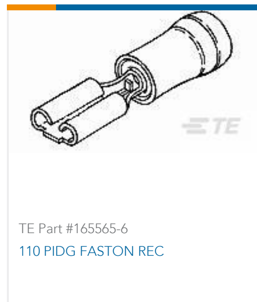
TE Part #165565-6 110 PIDG FASTON REC