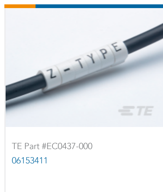
TE Part #EC0437-000 06153411