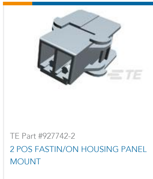
TE Part #927742-2 2 POS FASTIN/ON HOUSING PANEL MOUNT