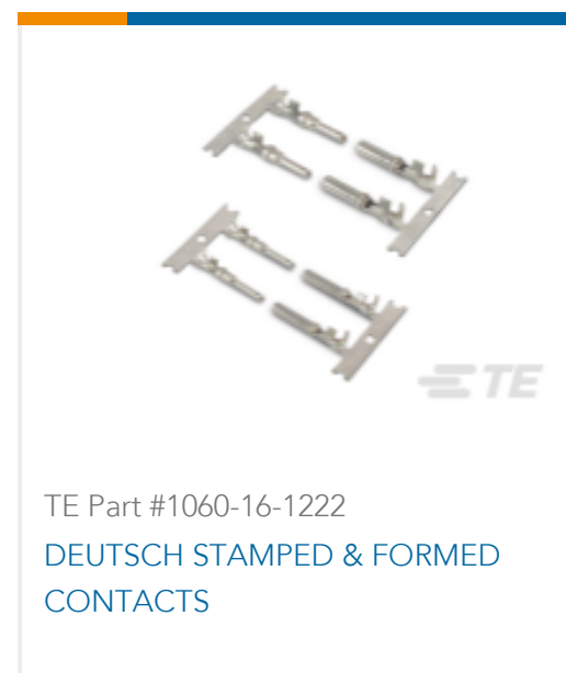
TE Part #1060-16-1222 DEUTSCH STAMPED & FORMED CONTACTS