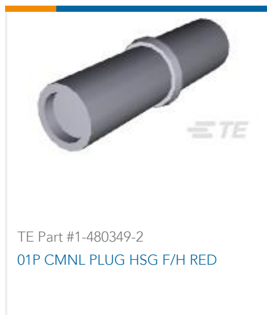
TE Part #1-480349-2 01P CMNL PLUG HSG F/H RED