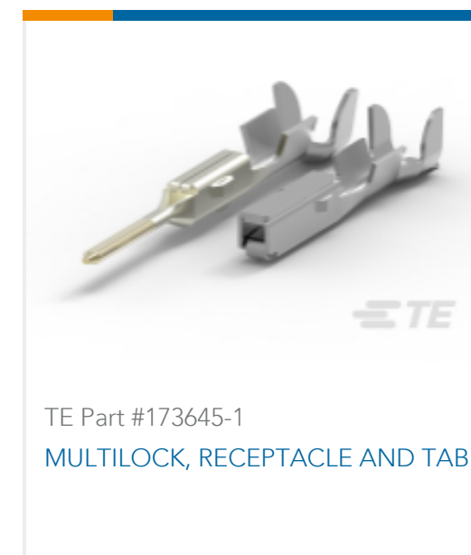
TE Part #173645-1 MULTILOCK, RECEPTACLE AND TAB CONTACTS