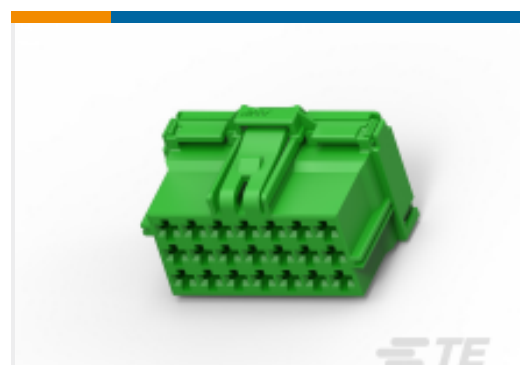
TE Part #1-2112891-2 AMP MCP, UNSEALED CONNECTOR HOUSING