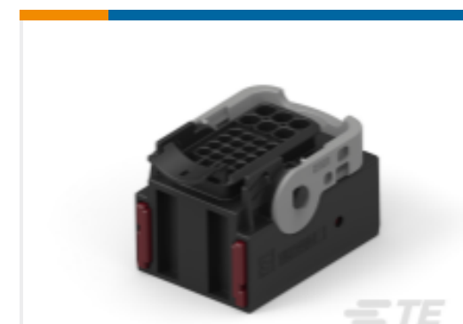
TE Part #1-1823440-1 22POS, MIXED, REC HSG, ASSY, SEALED