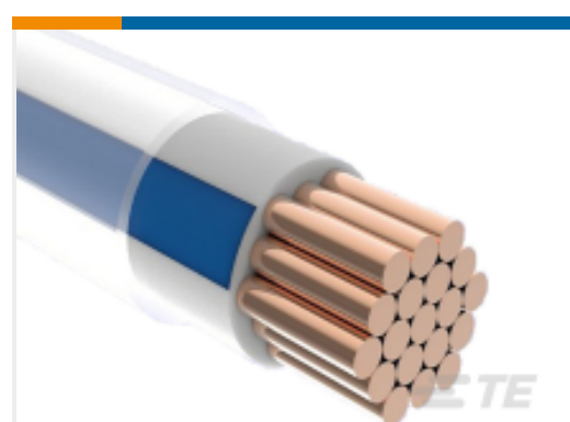
TE Part #E033443001 ACW0219-2.50-98(NS)