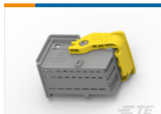
TE Part #1-2141846-3 AMP MCP BACKSHELLS