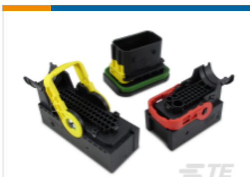
TE Part #1-2112041-2 LEAVYSEAL HOUSINGS