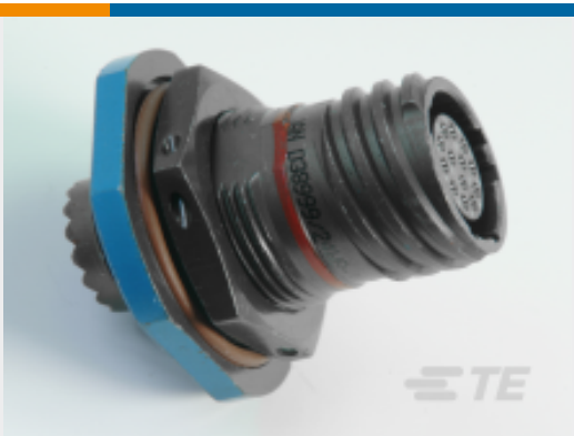
TE Part #YDTS24G25-35SNV001 Jam Nut Receptacle: D38999, Electroless Plating, 25-35 Insert