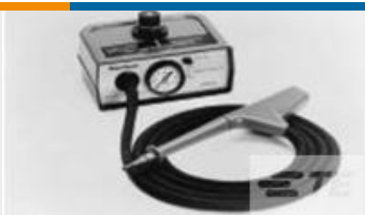
TE Part # 582602-000 AA-400-32-MK3-SUPHTR-120V