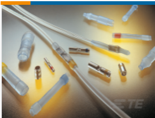
TE Part #650083N002 D-436-59CS2612

Datasheets & Catalog Pages 1654025_Sec10_AA-400