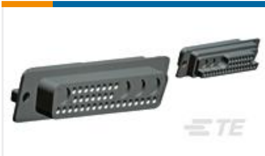
TE Part #208550-1 AMPLIMITE RECEPT ASY,COAX MIX