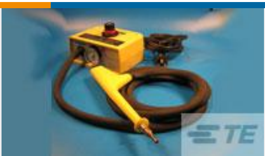
TE Part #979663-000 AA-400-102-MINI-SOLD-TIP