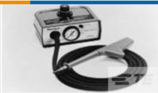
TE Part #582602-000 AA-400-32-MK3-SUPHTR-120V