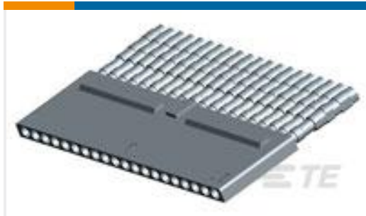
TE Part #697123-000 MTC100-JB2-S14