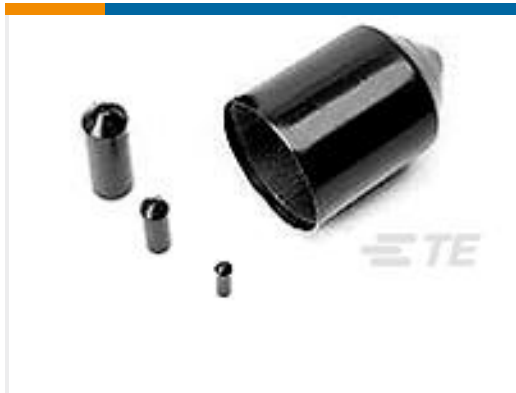
TE Part #843532-000 101A062-4/42-0