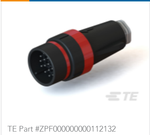
UIC558 PLUG - MALE - 13 OR 18 PINS