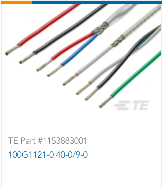
TE Part #1153883001 100G1121-0.40-0/9-0