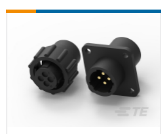
TE Part #211398-1 CPC SERIES 1