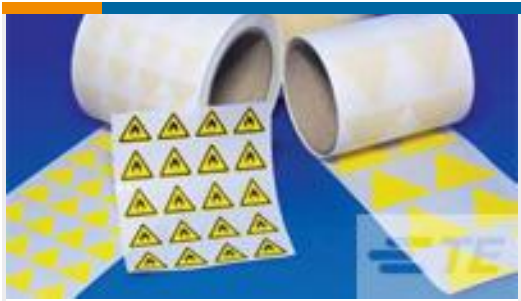
TE Part #4-1768018-2 EET-1325P-4