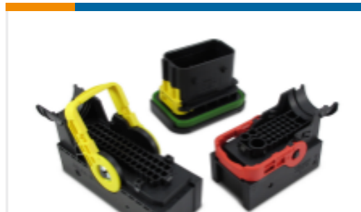
TE Part #1-2112041-2 LEAVYSEAL HOUSINGS