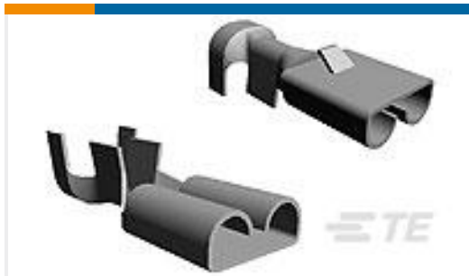
TE Part #160927-2 FF 250 REC 1.0-2.5MM2 TPBR