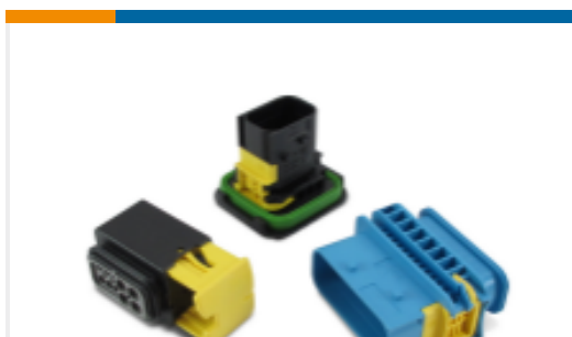
TE Part #1-2299782-1 HEAVY DUTY SEALED CONNECTOR HOUSINGS