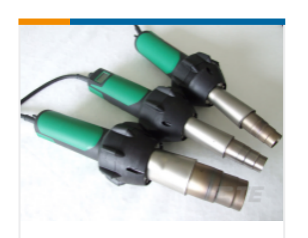
TE Part # EG1114-000 CV1981-ST-230V1600W-EU