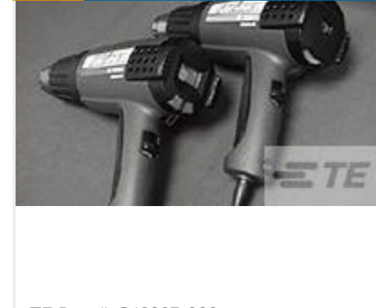
TE Part # CJ2087-000 HL2010E-KIT-120V