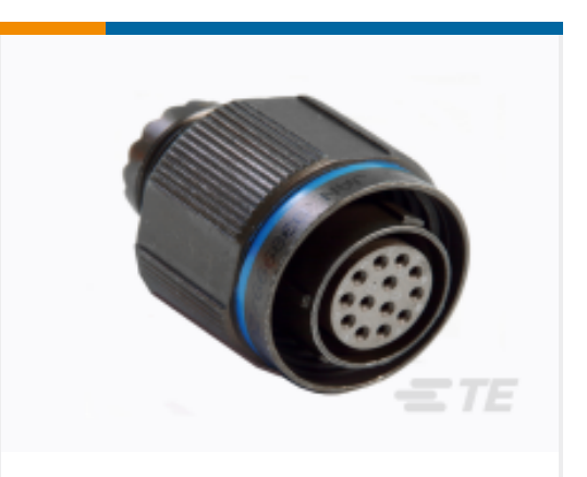
TE Part #YDTS26W23-35PNC001 D38999: Straight Plug, 23-35 Insert