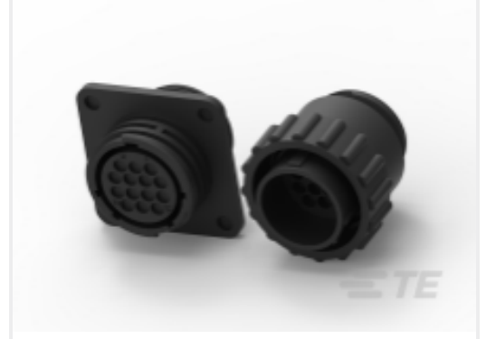
TE Part #206708-1 CPC SERIES 6