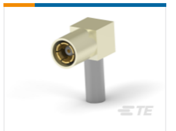
TE Part #414002-4 SMB Connector: Female (Plug), Mated Outer Dia. 4.75mm, 50 Ohm