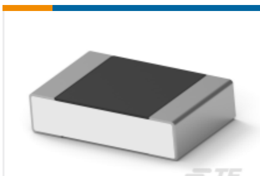
TE Part #2-2176373-6 RQ 0805 18R2 0.1% 10PPM 1K RL