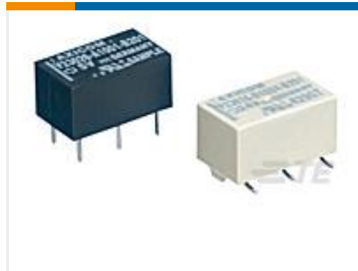
TE Part #1-1393774-7 V23026A1006B201