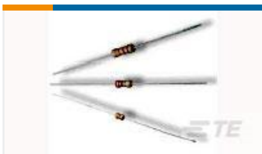
TE Part #1-1623931-9 CFR25 5% 39R