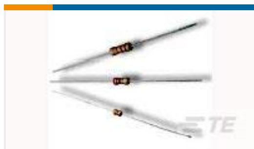
TE Part #2-1623931-9 CFR25 5% 3R9