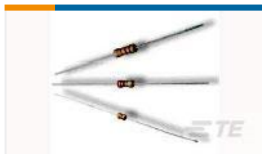
TE Part #8-1623931-4 CFR25 5% 8R2