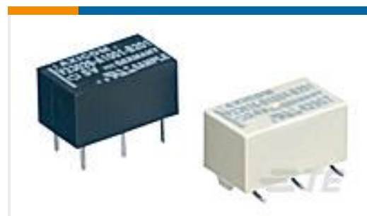
TE Part #2-1393774-0 V23026C1051B201