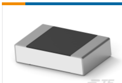
TE Part #4-2176373-1 RQ 0805 26R1 0.1% 10PPM 1K RL