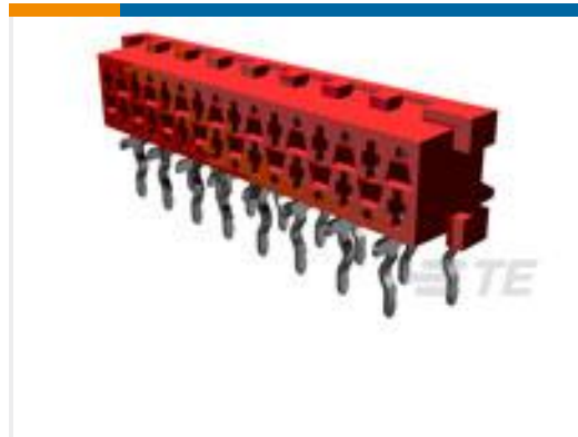
TE Part #8-215460-6 MICRO-MATCH FSID P