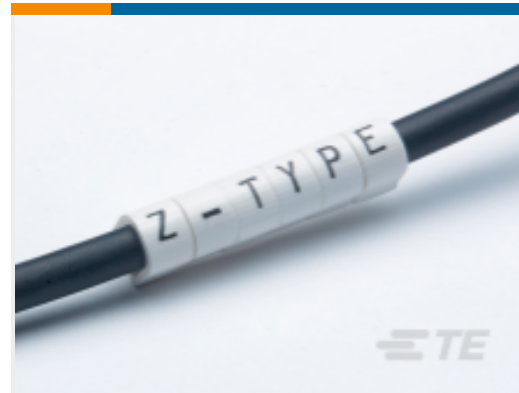
TE Part #EJ1954-000 Z-TYPE PUSH-ON MARKERS