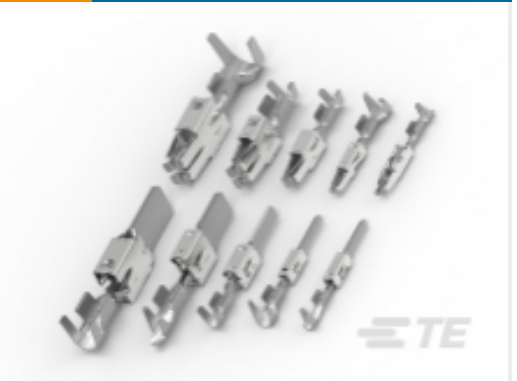
TE Part #964306-1 TIMER, RECEPTACLE AND TAB