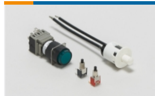
Push Button Switches(13)