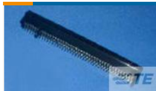
TE Part #2-1734774-2 PCI EXP 3.1L 98 POS BLK 30u"