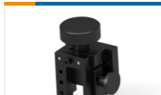
TE Part #2215082-1 ASSY, EXTRACTION TOOL