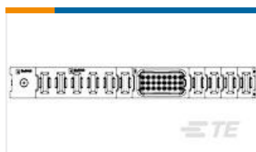
TE Part #6646495-1 CONNECTOR,SOCKET,FLATPAQ