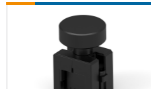
TE Part #2215083-1 HEADER REMOVAL TOOL, WHISPER SLIM