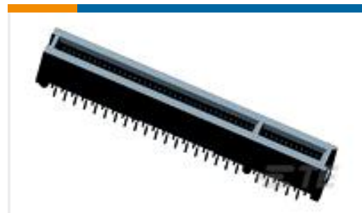
TE Part #2041612-5 PCI-E Card Edge,164P,Vertical,DIP, SLIM