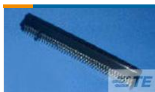
TE Part #3-1734774-2 PCI EXP 2.3L 64 POS BLK 15u"