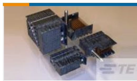
TE Part #2132739-1 IMP100S,R,RA4P6C,UG,39