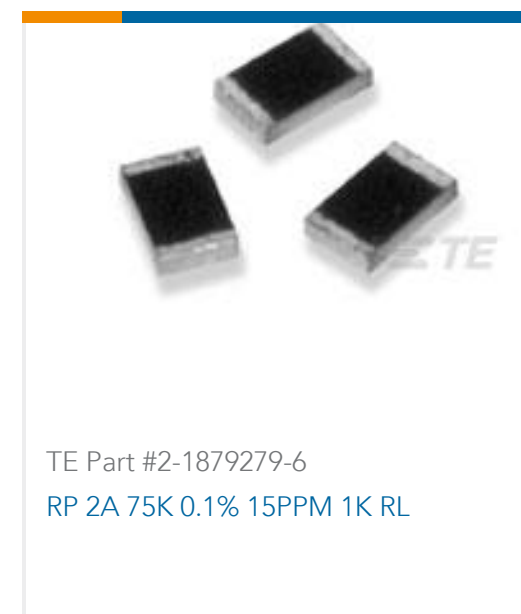
TE Part #2-1879279-6 RP 2A 75K 0.1% 15PPM 1K RL