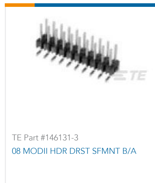
TE Part #146131-3 08 MODII HDR DRST SFMNT B/A