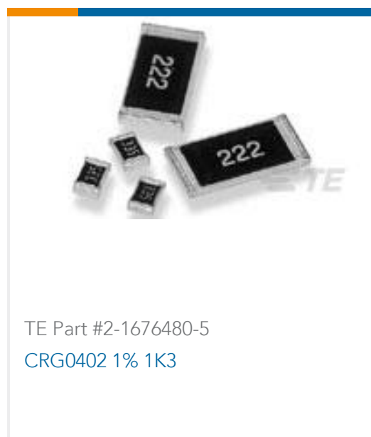
TE Part #2-1676480-5 CRG0402 1% 1K3