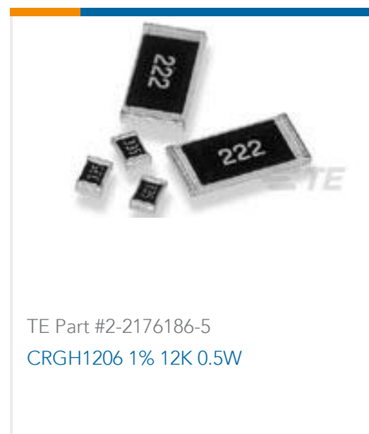
TE Part #2-2176186-5 CRGH1206 1% 12K 0.5W