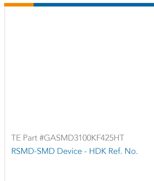
TE Part #GASMD3100KF425HT RSMD-SMD Device - HDK Ref. No.