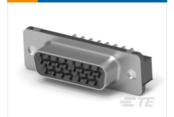
TE Part #747140-2 D-Sub Receptacle Assy: Vertical, Action Pin, Shell Size 2, 2.74mm