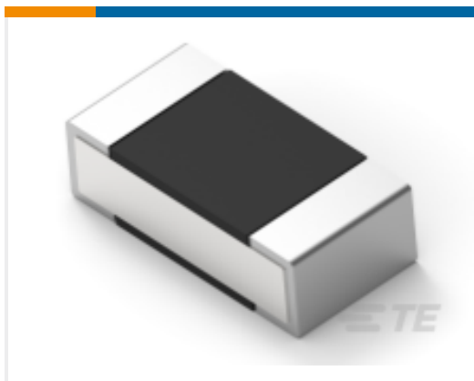
TE Part #4-2176307-6 RP 1E 0.1W 36K5 0.1% 25PPM 5K RL