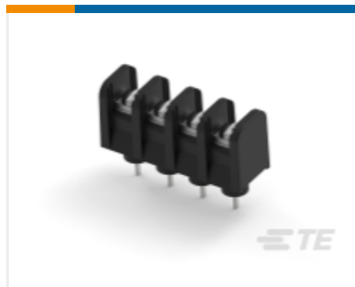
TE Part #1986563-4 SSB7TP040402=TERM BLOCK ASSY