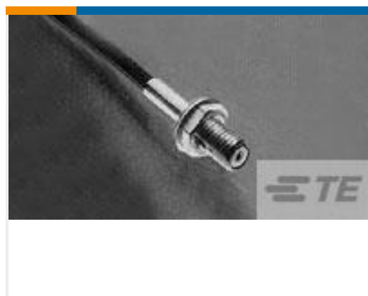
TE Part #2-330312-2 MINIATURE THREADED RECEPTACLES