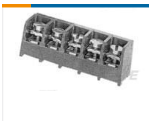
TE Part #3-1546159-1 6WWV-11-008=#6 TRIBARRIER TERM