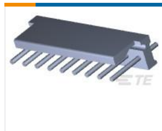
TE Part #3-641209-9 09P MTA156 HDR ASSY FL ST LF