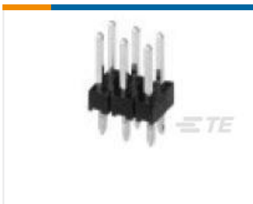
TE Part #104432-1 02 MODII HDR DRST B/A W/HD