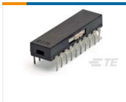
TE Part #1825011-4 ASF22RG04=DPDT AUTOSLIDE