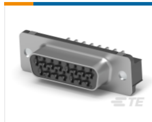
TE Part #747140-2 D-Sub Receptacle Assy: Vertical, Action Pin, Shell Size 2, 2.74mm