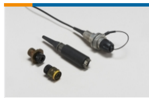
Expanded Beam Fiber Optics(9)