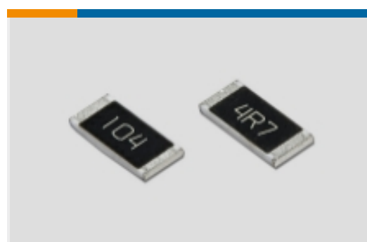
Surface Mount Resistors(545)