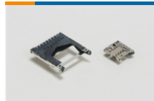
SD Card Connectors(1)